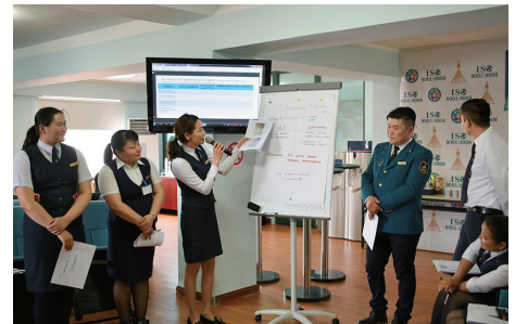
Presentation by a representative of the Social Insurance Office, giving proposals for improvement of counter operations.

In Mongolia, one of the challenges on social security is how to build a sustainable social insurance system, particularly pensions, while ensuring fairness among generations, gender and occupations. JICA has helped strengthen publicity for the social insurance system to increase participants in pension plans and improve the collection of premiums. In addition, JICA works with Social Insurance General Office to increase their capacity on the actuarial valuations of the pension system so that they will reform pension system based on demographic and tax revenue projections in light of the aging population and other factors.