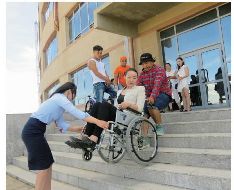
Hospitality training conducted by the project

In Mongolia, JICA provides comprehensive programs that support persons with disabilities throughout their lives at each life stage: childhood, school age, and adulthood. During childhood and school age, JICA works to establish a system for early detection of disabilities through infant examinations, improve education for children with disabilities, and construct accessible elementary and junior high schools. In adulthood, JICA aims to create a society where people with and without disabilities can work together. In particular, through the "Project for Promoting Employment of Persons with Disabilities", JICA has provided comprehensive support for the social participation of persons with disabilities and helped to design systems such as supported employment. JICA was also involved in the publication of Mongolia's first White Paper on Persons with Disabilities.