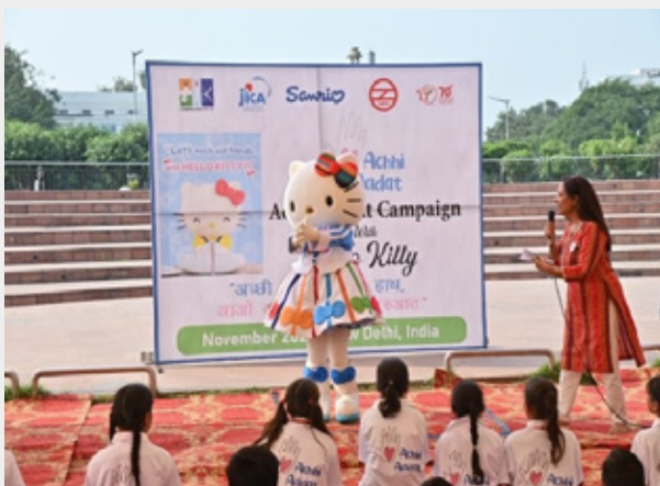
Hello Kitty handwashing demonstration at Central Park