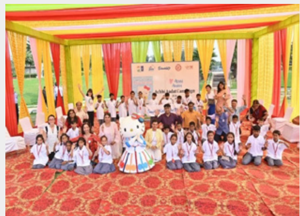
Group photo with students of St. James Convent School