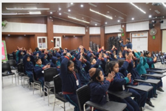
Children learned proper steps to wash hands