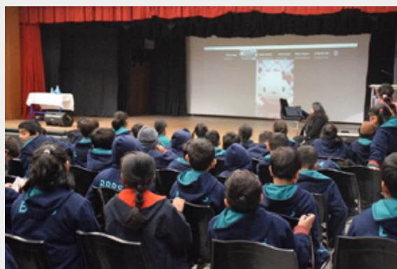
The Japanese famous character Hello Kitty joined the session from Japan