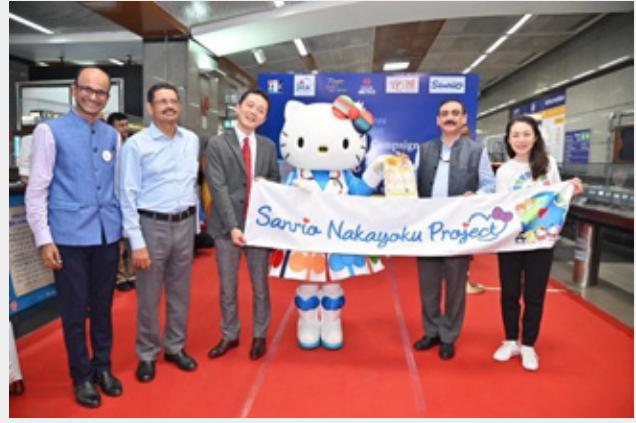
Group photo at Metro Museum, Patel Chowk Station