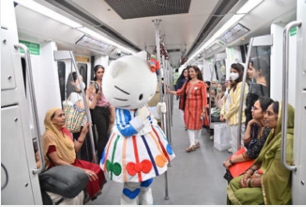
Hello Kitty on a female-only coach of Delhi Metro