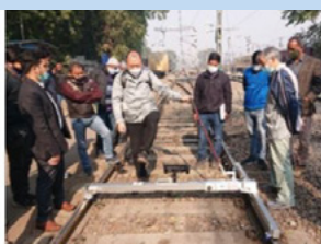
Indian engineers and JICA experts while demonstration at the site.

New Delhi, India, December 28, 2021: Under the ongoing Technical Cooperation (TC) Project 'Capacity Development on Railway Safety', JICA Experts team visited Northern Railway Track Maintenance Depot for demonstration of track geometry measurement with the help of a portable measuring trolley, lectured on the measuring mechanism and function equipped in the measuring trolley from