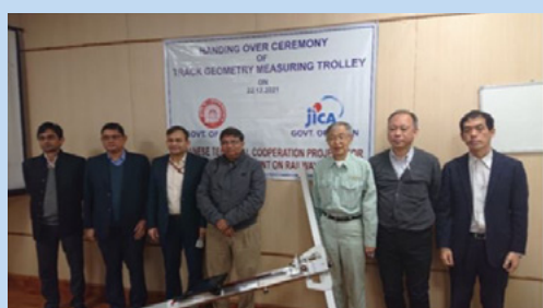
JICA transferred a portable track geometry measuring trolley to Northern Railways