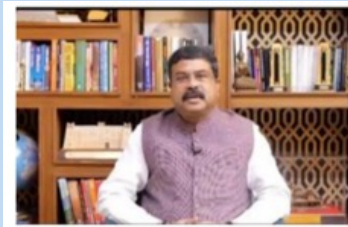
Hon'ble Minister for Education, Government of India, Shri Dharmendra Pradhan presented video message.

JICA's cooperation with IITH is one of the most successful examples of its holistic programmatic approach. The cooperation was based on the commitment between the Prime Ministers of the two countries in 2007.