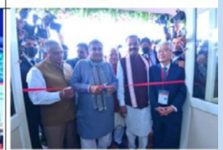
Ribbon Cutting for ITS Building