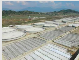
Greater Tirana Sewerage System Improvement Project

The ODA loans support developing countries by providing low-interest, long-term and concessional funds. The ODA loans are used for large-scale infrastructure and other forms of development that require substantial funds.