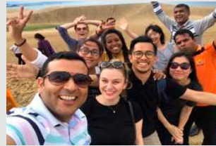
Training in Japan: Capacity development in sustainable tourism -based on Japanese tradition "Omotenashi –Hospitality"