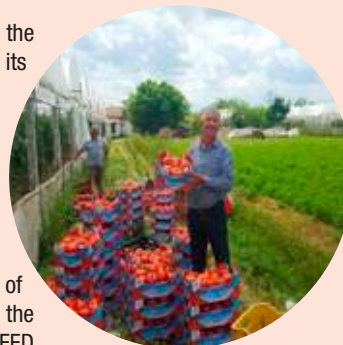
Beneficiaries of the Project

In order to tackle this issue, JICA and the government of Albania have launched this project. It intends to improve the financial access among small-scale farmers through FED invest, the implementing agency of the project.