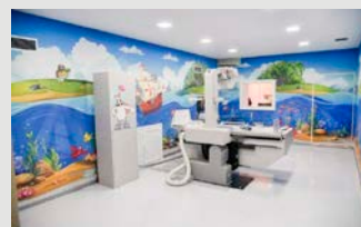
Paediatric Clinic of "Mother Theresa University Hospital Centre" in Tirana

Grants are the provisions of funds to developing countries that have low income levels, without the obligation of repayment. Grants are used for the improvement of basic infrastructures such as schools, hospitals, water-supply facilities and roads, along with obtaining health and medical care, equipment and other requirements.