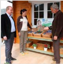
Smallholder Families' Financial Inclusion Project

For the human resources development and the formulation of administrative systems of developing countries, technical cooperation involves the dispatch of experts, the provision of necessary equipment and the training of personnel from developing countries in Japan and other countries. The cooperation plans can be tailored to address a broad range of issues.