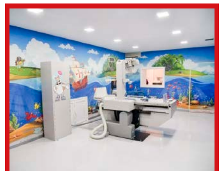
Paediatric Clinic of "Mother Theresa University Hospital Centre" in Tirana

implemented. The main objective of this project is to maintain quick diagnosis and treatment at the Paediatric Hospital for infant and children patients. New medical equipment, such as X-ray radiography & fluoroscopy, ultrasound, patient monitors, nebulizers, suction machines, as well as spare parts, were supplied to the Paediatric Clinic of Mother Theresa University Hospital Centre during 2016-2017.