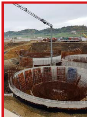
Sewage treatment facilities construction

With JICA's support, the quality of both groundwater and river water are expected to be improved through the construction of sewerage facilities (sewage treatment plants, sewage pipes and drains) in the Greater Tirana Area.