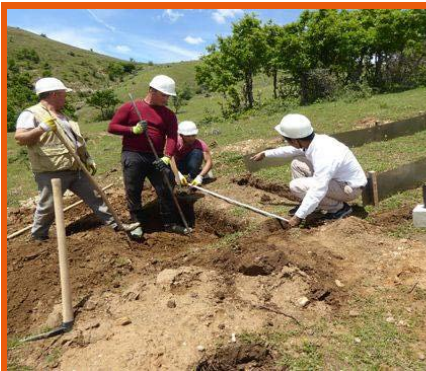
Installing Forest Monitoring Plots

Through this project, the existing Macedonian Forest Fire Information System (MKFFIS) will be upgraded and expanded with an aim to strengthen the disaster prevention and reduce the effects of the natural disasters caused by the forest fires, torrents, floods, soil erosion and landslides.