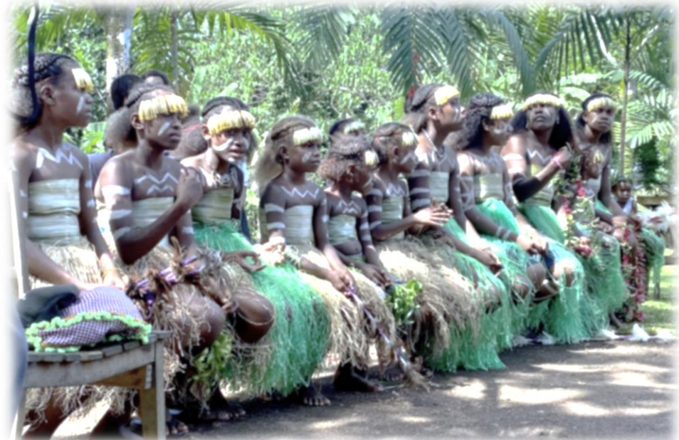
Komuniboli Community, East Guadalcanal The Project on Capacity Development for Sustainable Forest Resource Management in Solomon Islands

Ting Tugeda en Waka Tugeda fo Gudfala Laef blo lumi en Future!