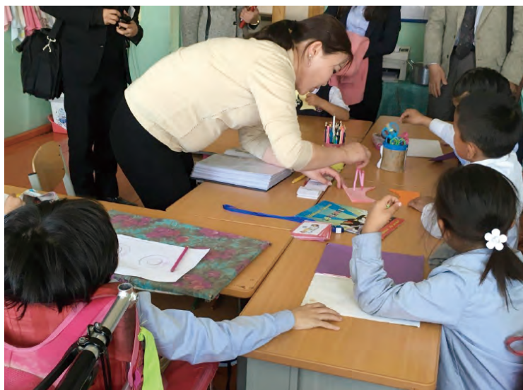
JICA expert uses a compass in a classroom to direct children's attention

https://www.jica.go.jp/project/english/mongolia/013/index.html