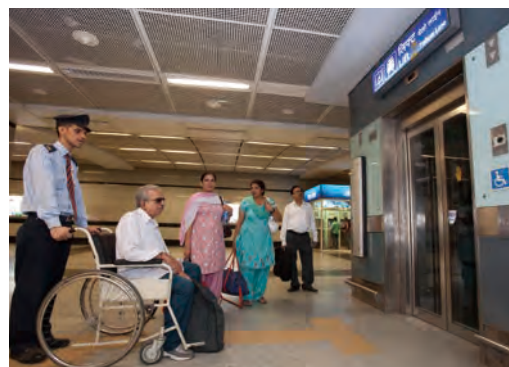
A wheelchair user and station staff waiting at the platform for the subway

In Delhi, where traffic congestion and air pollution have become serious problems as the economy has developed and the population has grown, the project constructed a subway (the Delhi Metro) using Japan's financial assistance and technology. Through repeated discussions with Disabled People's Organizations (DPOs) from the planning stage, accessibility standards were adopted, including the installation of elevators and wheelchair ramps and the elimination of differences in level in railroad cars and on platforms. As a result the completed railroad cars and stations are accessible not only for persons with disabilities, but for most people. Also, the agency operating Delhi Metro became conscious of accessibility for customers, which was one factor leading to increased satisfaction on the part of users. In addition, the efforts on Delhi Metro have had a positive effect on the awareness of personnel of the organization administering roads. This has led to the improvement of the environment surrounding stations in consideration of the safety of users. Examples include the renovation of street lights and parking near stations and the construction of a new bus terminal.