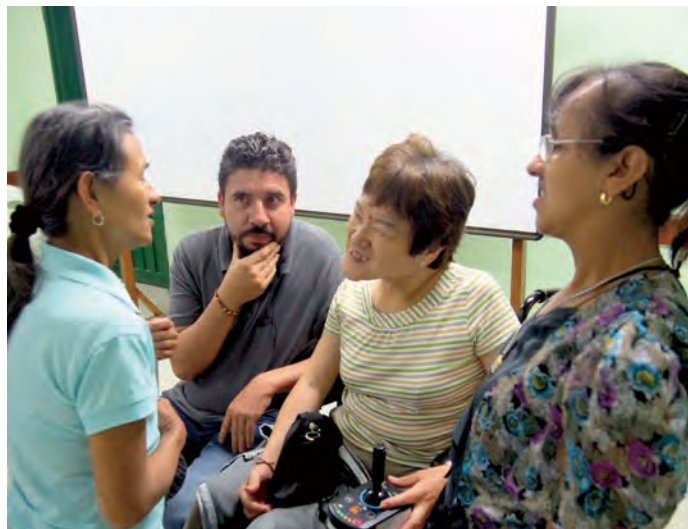
A JICA expert exchanges with local persons in Colombia