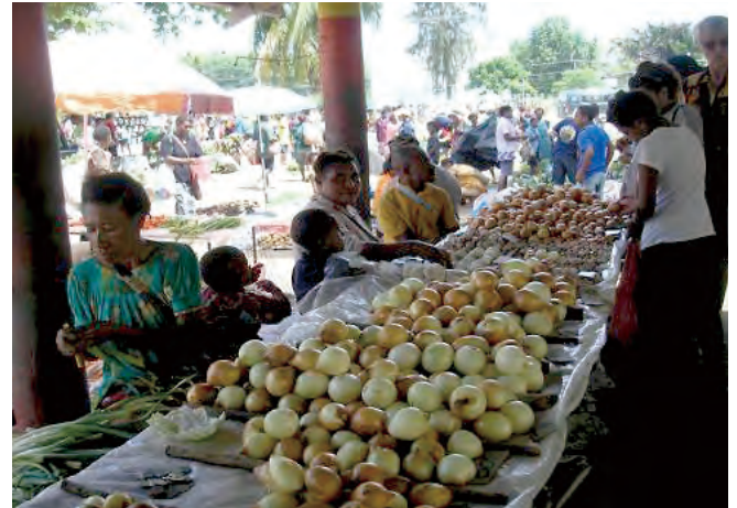
Locals buying and selling vegetables at the market

It is important that markets have accessible designs for anyone because those are necessary facilities for daily lives of community people. In developing countries, however, the actual situations are that often such markets are difficult for persons with disabilities to access, for instance having many steps and no wheelchair-accessible restrooms. By incorporating the accessibility concept from the preparatory study stage, this project realized the accessible market for anyone in the local community, not just persons with disabilities. Measures to do so included installation of ramps between facilities and accessible restrooms for persons with disabilities.