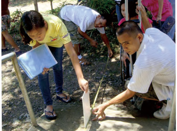
DPOs checking accessibility of a facility