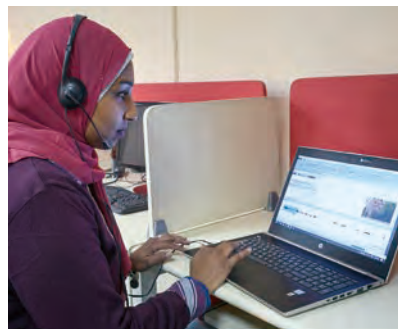
A woman working to produce DAISY books on a computer

The Digital Accessible Information System (DAISY) is a tool that provides books in an easy-to-understand format for persons with difficulty reading printed books, but development has been slow for unique languages such as Arabic. Since Japan has experience in adapting DAISY to Japanese, a unique language, it has been able to provide support for developing DAISY book production software in the Arabic language by using that same technology. We have also trained over 42 human resources to produce DAISY books in Arabic, and we are dedicated to working to improve information accessibility for persons with disabilities by developing an infrastructure for producing and distributing DAISY books in Egypt.