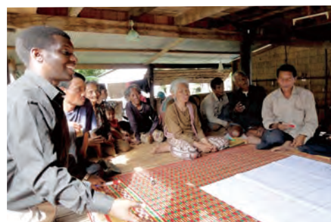
Training participants interacting with local residents in Cambodia

The number of persons with intellectual disabilities in developing countries have quite limited opportunities to access any form of public assistance. Every year since 1980, JICA has conducted a training course for government officials, teachers, social workers, NGO staff members and others to make it easier for persons with intellectual disabilities to live in their local communities. A total of 370 people from 67 countries had participated in the training as of this writing in 2020. The participants deepened their understanding of the human rights of persons with intellectual disabilities through lectures and field trips in Japan and they learned that it is possible for such people to participate in society by receiving appropriate assistance. The training then moved to Cambodia, where in a village participants analyzed how local residents, regardless of whether they have impairments, are living, and what kind of assistance they need. Participants then planned how to expand in their own countries activities to support persons with intellectual disabilities.