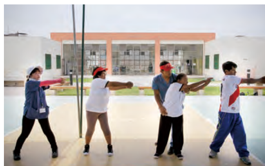
Young persons with disabilities receiving gymnastics instruction

JICA has been implementing training programs that promote the social participation of persons with disabilities through sports for over 30 years. After returning to their home countries, these training participants engage in activities to identify and develop talented athletes and also raise awareness. Over time, this series of initiatives has succeeded in helping to promote sports among persons with disabilities in several countries, such as by inspiring leaders in sports for persons with disabilities, and has even resulted in the development of athletes who compete in the Paralympic Games. With the aim of promoting social participation of persons with disabilities by helping popularize among them in developing countries, the training held in 2019 taught government officials and others about Japanese system for promoting sports among persons with disabilities and passed on competition-related knowledge and skills.