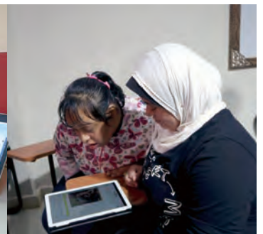
A girl and her mother engrossed in a DAISY book on a tablet