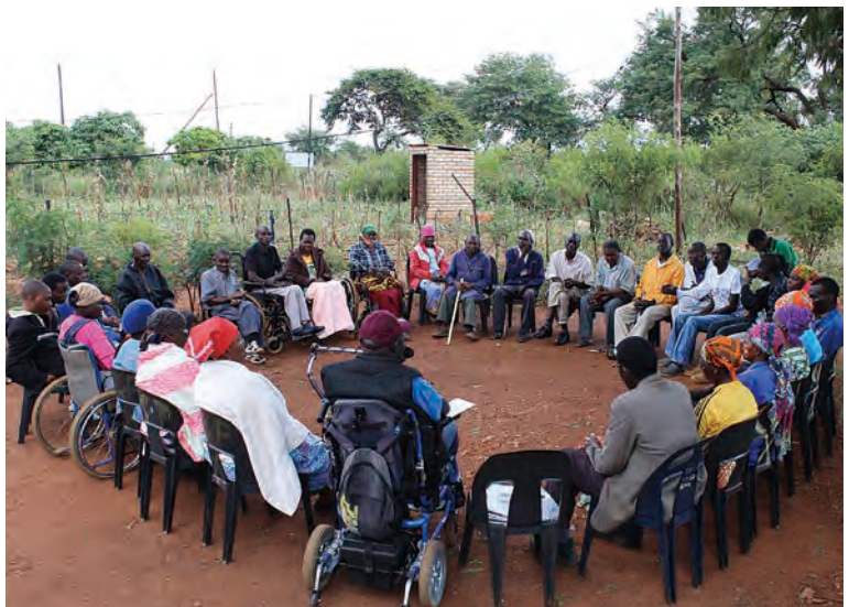
Participants sit in a circle as they take part in peer counseling

https://www.jica.go.jp/project/english/southafrica/002/index.html