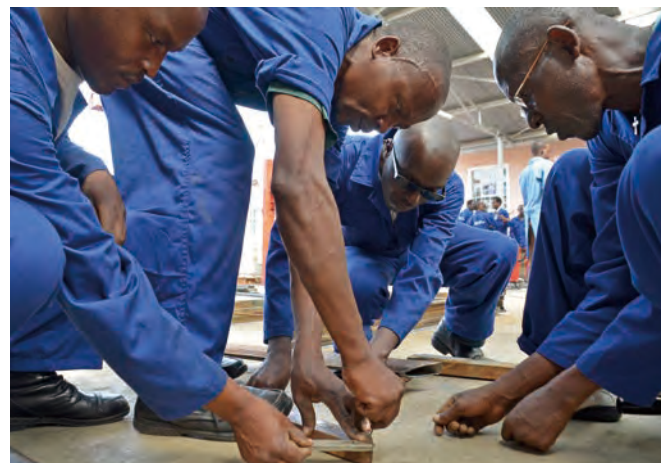
Skill trainees working as a group

https://www.jica.go.jp/project/english/rwanda/003/index.html