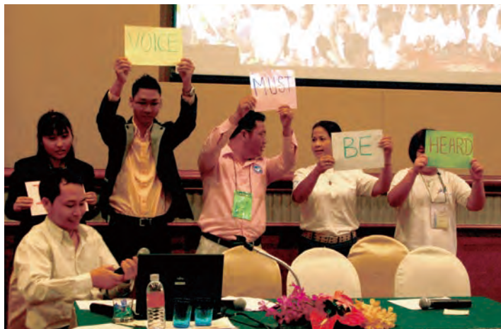
Persons with disabilities from Asian countries give a group presentation at a workshop

The Asia-Pacific Development Center on Disability (APCD), established in Bangkok through Japanese grant aid, functions as a base for regional cooperation. The APCD works to empower persons with disabilities in over 30 countries in the Asia-Pacific region with these people taking on a leading role in promoting social change and creating an inclusive society. During and after the project period, over 3,200 people have participated in training related to strengthening Disabled People's Organizations (DPOs) and implementing Community Based Rehabilitation (CBR), which has succeeded in training many leaders. Also, six regional networks have been launched: the CBR Asia-Pacific Network, Empowerment Cafe, ASEAN Autism Network, South Asia Disability Forum, Central Asia Disability Forum and Asia-Pacific Federation of the Hard of Hearing and Deafened. APCD has also supported the formation of groups of persons with intellectual disabilities who are involved in activities for them, launching the first of such groups in Thailand, Myanmar, and Cambodia. APCD, now an incorporated foundation, is an important partner for JICA, and collaboration continues in a variety of ways that include promoting the Convention on the Rights of Persons with Disabilities in the Asia-Pacific region, conducting training on disability inclusion for persons with disabilities in neighboring countries, and the dispatching of Japan Overseas Cooperation Volunteers to APCD.