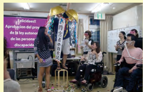
Welcome party in Mainstream Association for training participants

The success achieved in Costa Rica is also having an impact on neighboring countries. In 2020, an online kick-off seminar was held to launch a network to promote the independent living movement in Latin America from Mexico to Argentina, attracting 400 participants from countries in the region. To further promote this initiative, JICA continues to implement training in Japan and Costa Rica to foster leaders of persons with disabilities and promote independent living. Persons with disabilities in Costa Rica, who have been empowered by the independent living movement in Japan, have grown to become leaders in promoting the empowerment and social participation of persons with disabilities around Latin American, and are now serving as inspirational partners of JICA.