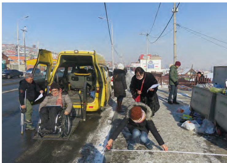
A group of persons with disabilities measures the road width to check its accessibility