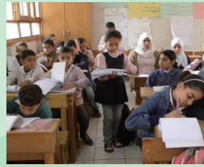
A student conducts classroom coordinator activities (nicchoku)

Under the Egypt-Japan Education Partnership of 2016, JICA has worked with the Government of Egypt to introduce Japan's approach to education in Egyptian classrooms. These approaches include conducting school activities like assigning daily classroom coordinators (nicchoku) and having students clean their classrooms, which nurture important values like teamwork and responsibility in students. The Government of Egypt has worked with JICA to adapt these activities, as well as arts and crafts, music and physical education, to best align them to Egyptian culture, and the Government of Egypt is now trying to introduce these practices across all its elementary schools.