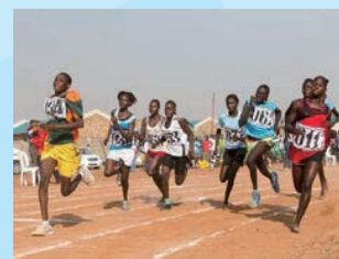
Athletes compete in the Women's 800m Final at National Unity Day

brought together athletes from all over the country who have qualified for the competition to compete in good sportsmanship to foster peace and reconciliation among different tribal and ethnic groups.