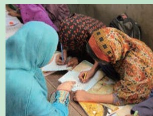
Girls learning at non-formal school

JICA’s Advancing Quality Alternative Learning Project provides quality learning opportunities to socially vulnerable and marginalized populations in Pakistan through alternative education systems . It aims to address the gender gap in the educational access, which results in lower literacy rate for women (48%, compared to national literacy rate of 60%).