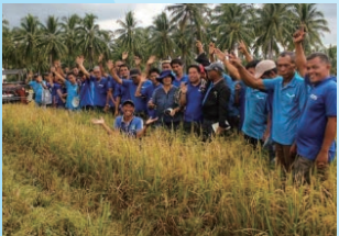
Mindanao farmers participate in an upland rice production project