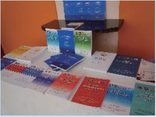
Laos produces new textbooks and workbooks on its new Civil Code