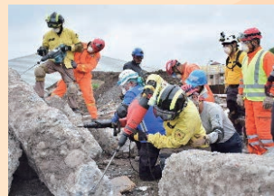
Trainees practicing urban search and rescue operations