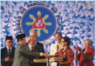
Philippines-Moro Islamic Liberation Front sign peace deal

Since the 1990s, JICA has continued to support Mindanao's local governance, community development, public service, and economic activities in order to protect individuals' rights to life, livelihood, and human dignity , with the hopes to help establish an autonomous Bangsamoro Government in 2022.