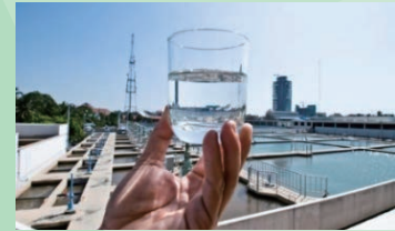
Clean water from the rehabilitated Phum Prek Water Treatment Plant