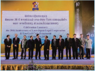
Laos launches its first Civil Code

The rule of law serves as the foundation for individuals' rights to life, livelihood, and human dignity . Across Asia, JICA has worked to strengthen judicial systems and policies, as well as promote community policing and support media development. In Laos, JICA has provided long-term support to help the Government of Laos draft and enact their country's first Civil Code.