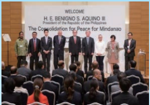
Hiroshima hosts Mindanao peace conference