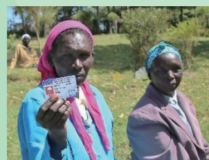
Participants of Kenya's Health Insurance Subsidy Program

UHC is the idea of ensuring that everyone has access to sufficient quality health services, without exposure to financial hardship. JICA has worked to achieve UHC and build resilient health systems for all by providing a health sector policy loan to the Government of Kenya to enable them to implement programs like Free Maternity Services and the Health Insurance Subsidy Program. With JICA's technical cooperation, Senegal has strengthened the country's Community Health Insurance System and Free Health Care Services.