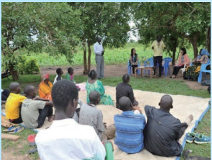
Community development workshop for local Ugandan farmers