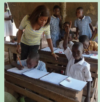
Children learning to solve math problems through their math workbooks