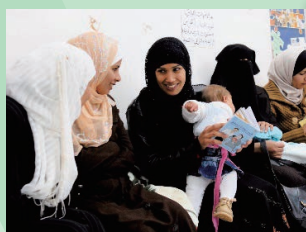
The MCH Handbook and Smartphone App

The MCH Handbook has now been adopted by 34 countries with JICA's support.