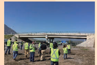
Trainees learning about resilient infrastructure