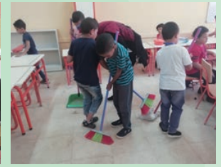
Students working together to clean their classroom