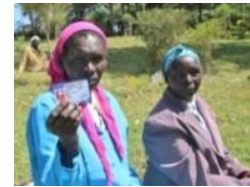
Beneficiary people of HISP in Kenya

"Health Sector Policy Loan for Attainment of UHC in Kenya (ODA loan of up to 4 billion yen agreed in 2015)" supports the policy actions of the Government of Kenya for implementing Free Maternity Services, Health Insurance Subsidy Program (HISP), and Result-Based Financing for primary care facilities. By supporting these policy actions, this loan aims to increase facility-based delivery rates (from 44% in 2013 to 65% in 2018) and beneficiary households of HISP (from 0 to 42,300 households in 2018).