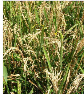
Neck blast → Empty grains

Upland rice is more severely damaged than lowland rice.