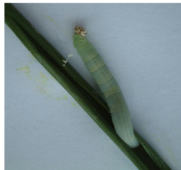
Satyrid butterfly (larva)