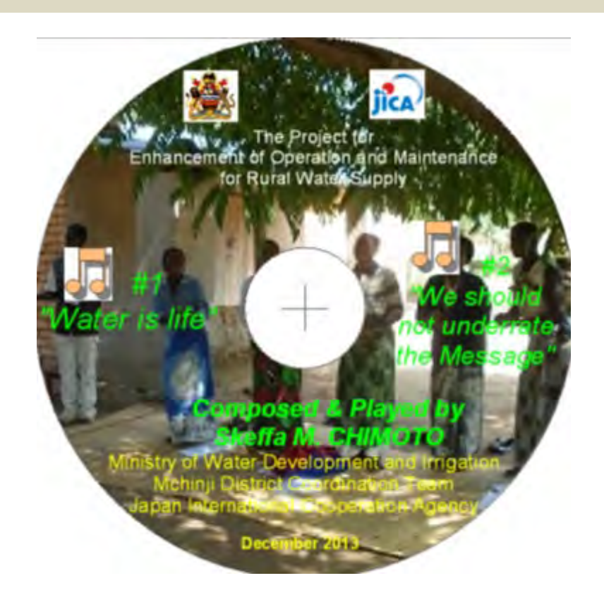
Figure 2: CD with promotion songs provided in the tool kit

Discuss about effective events and time to sing the promotion song so that the message is passed on to the whole community. Some villagers use the promotion song in village meetings, village bank meetings, when the borehole surroundings need to be cleaned, when the soak away pit looks untidy, when conducting development work such as moulding bricks and construction of sanitary facilities/structures, etc.