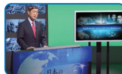
Know More About Japanese Modernization Lecture Series

https://www.jica.go.jp/dsp-chair/english/chair/modernization/index.html