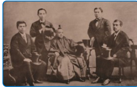
Members of Iwakura Mission (1872)

Japan is the first country that has modernized into an independent, democratic, prosperous, and peace-loving nation based on the rule of law, without losing much of its tradition and identity from a non-Western background. Therefore, Japan could serve as one of the best examples for developing countries to follow in their own development.