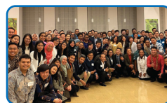
Find Out More About JICA Development Studies Program and JICA Chair

Website: https://www.jica.go.jp/english/activities/schemes/dsp-chair/index.html