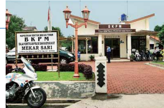
An Indonesian-style police box modeled after those in Japan