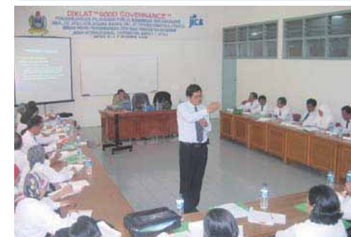
Seminar for improved government services based on good governance concept

As for decentralization, Indonesia is striving to implement projects that better meet regional needs by reinforcing the authority of local governments. This includes allocating budgetary expenditure to local governments and transferring the central government's field offices to local government control. Nonetheless, further improvement is needed in reinforcing the capabilities of local governments, which have little experience taking the initiative to plan and implement projects.