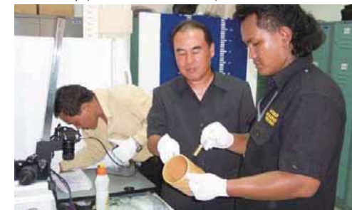
Guidance of criminal identification techniques