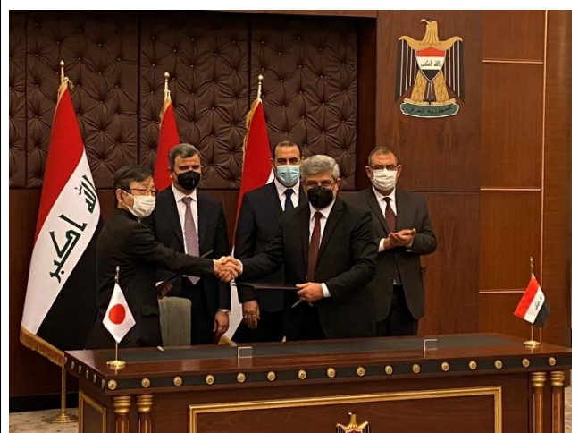
Photos during the Ceremony