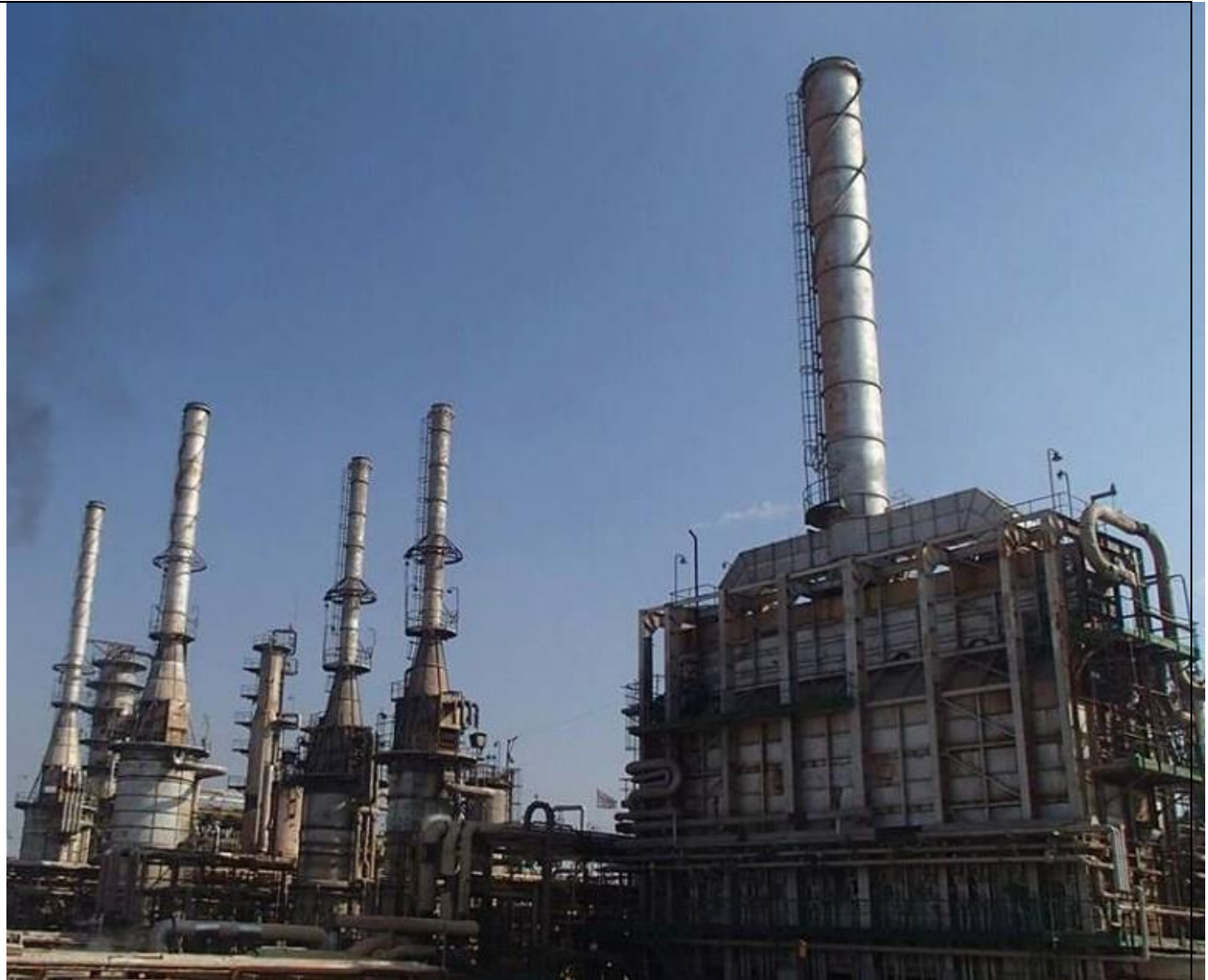
Existing plant of Basrah Refinery, next to which the new plant will be constructed under Basrah Refinery Upgrading Project funded by JICA's loans

The Japan International Cooperation Agency (JICA) is a development aid agency under the Japanese Government. It provides official development assistance (ODA) in the forms of technical cooperation, grant and ODA loan worldwide. JICA has signed 31 ODA loan agreements, total amount of which is approximately JPY 830 billion (equivalent to USD 7.7 billion), with Iraqi Government for economic and social infrastructure projects and programs in Iraq since 2008. The Agency has also provided the grant-based training programs for nearly 10,000 Iraqi officials as well as several technical cooperation projects since 2003.