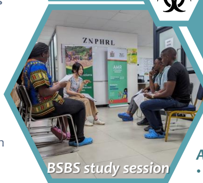
BSBS study session