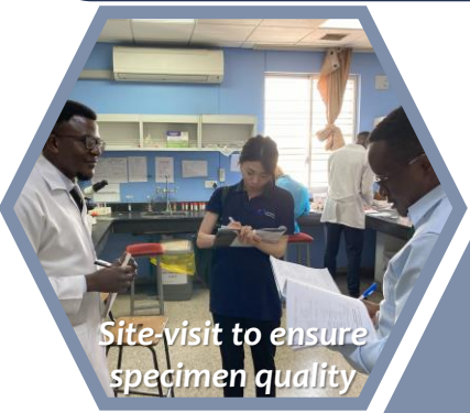
Site visit to ensure specimen quality

QMS is fundamental system/protocol to enhance laboratory services. In addition to the entire sample process management, including pre-examination (sampling, specimen storage and shipping), examination (test procedures), and post-examination (record keeping and reporting etc.), all laboratory organizational systems (organization, staff, procurement and inventory, documentation and storage of documents and records, internal and external assessment, etc.) related to quality testing including safety and equipment are subjected to management and control. Continual improvement is implemented based on the PDCA (Plan-Do-Check-Act) cycle.