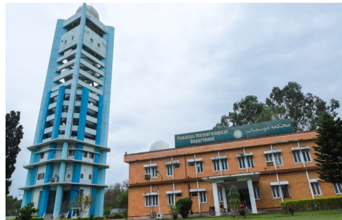
Meteorological radar in Islamabad