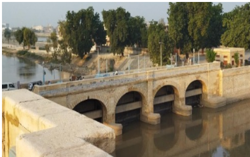
Barrage in Sukkur