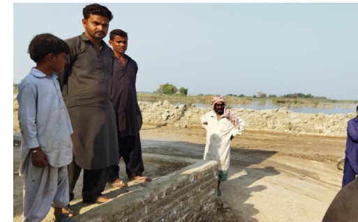
Flood damage area in Sukkur