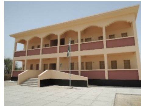
Upgraded girls' elementary school