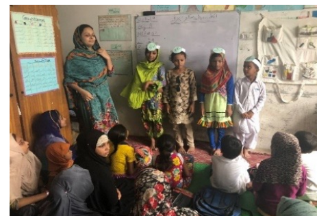
Students learning in non-formal learning center