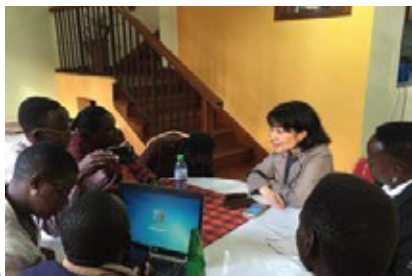
Chief Adviser to OCCADEP leading group discussion on County Health Strategic Planning

The Project further supported the Counties in health strategic and annual work planning, performance reviews and held forums for the counties to share their innovative