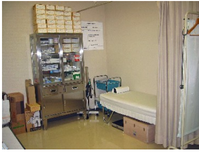
Clinic for Medical Consultation