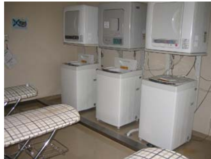
Laundry and Ironing facility