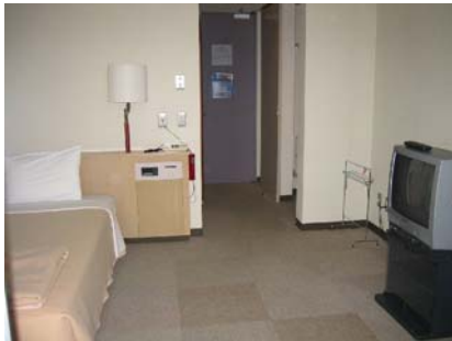
Accommodation (single room)