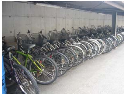
Free Bicycle Service