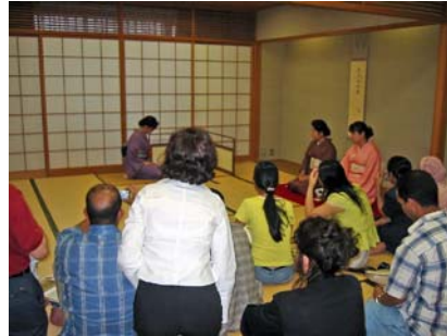
Japanese-style Room for tea ceremony