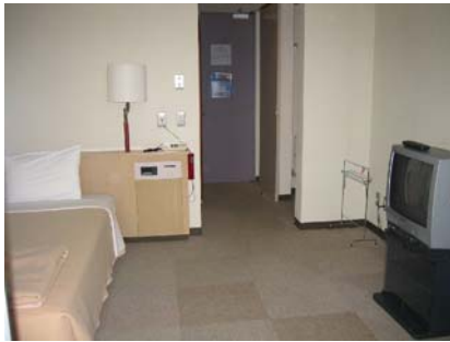
Accommodation (single room)