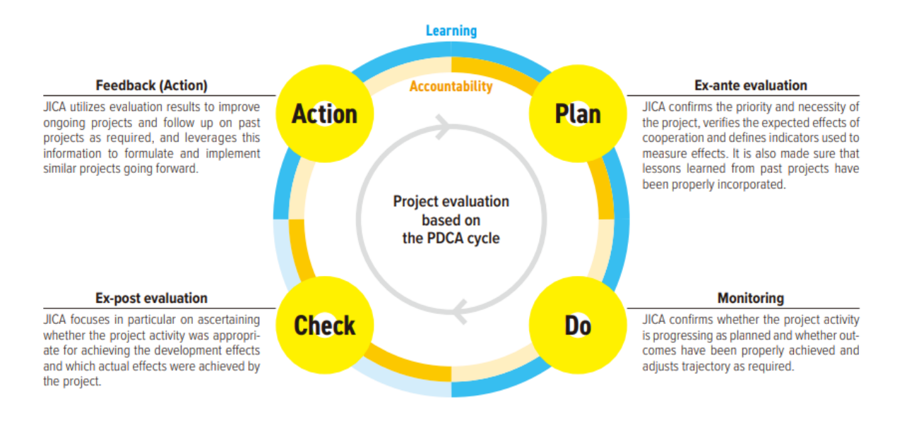
Figure 2: JICA's Project Evaluation based on the PDCA Cycle

JICA implements its projects under a continuous PDCA cycle: plan, do, check, and action (Figure 2). The project evaluation is conducted with aim to further improve operations from lessons learned and ensure public accountability. In addition to evaluation of individual projects, JICA also conducts comprehensive and cross-sectoral evaluations.