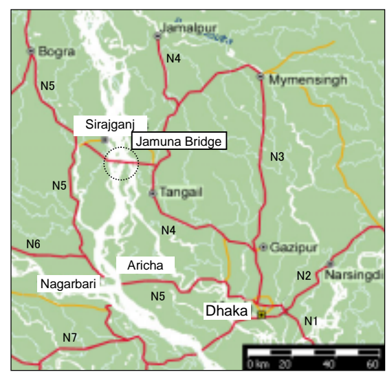
Figure 1 The Location of the Jamuna Multipurpose Bridge

predicted at the time of planning. One reason for this was that the toll of 1,000 taka* for goods vehicles was relatively higher than the ferry fare of approximately 700 taka (see Table 2). Another reason was that on the National Route No. 4 (N4), which links the Jamuna Bridge with the capital city of Dhaka, there were places where the traffic flow was not smooth due to the work being conducted to widen the road that started in 1998**, while the ferry service for the Aricha-Nagarbari sector, which is connected to Dhaka by N5, was more convenient. A third reason was that