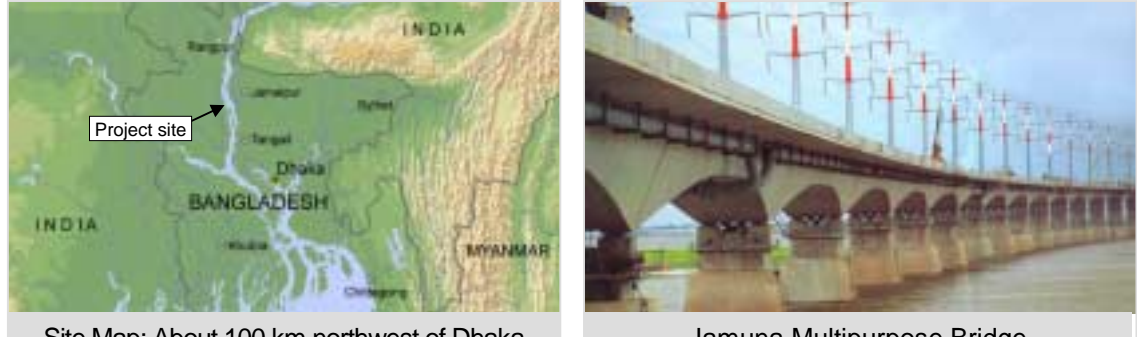
Site Map: About 100 km northwest of Dhaka