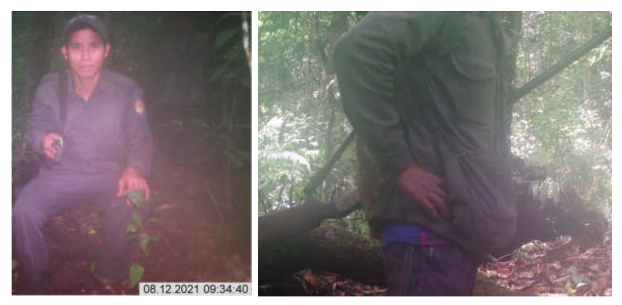
Figure 22c. Hunters captured on camera traps