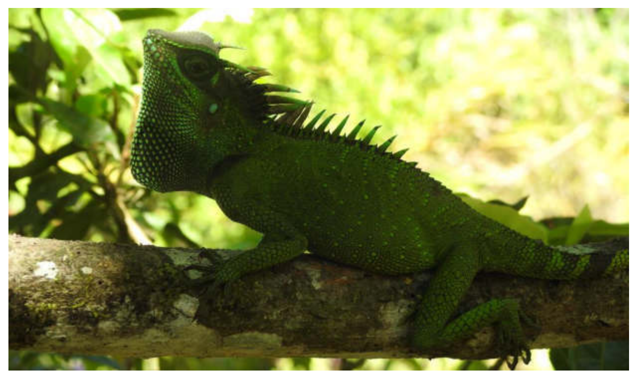
Figure 20. Annamite horn dragon (Acanthosaura sp)