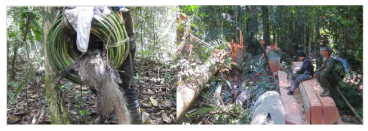
Figure 22a. Some evidences of threats (hunting and logging)

were found during the survey and evidences from camera traps in all SBs particularly the SB1 and SB5. Snare lines were found occasionally in the forests. Hunting some GT species, including Gibbon and Red-shanked Douc Langur were reported but mostly by opportunistic encounters. As well as collecting juvenile Douc for sale by the villagers of Ban Ta-ok noy was reported as they caught it from the SB2.