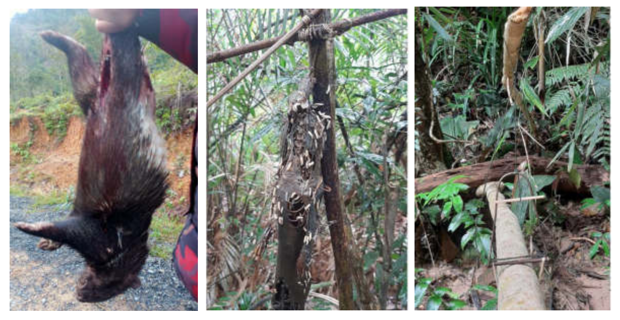
Figure 22b. Hunting (Porcupine), trapped dead animal and snares