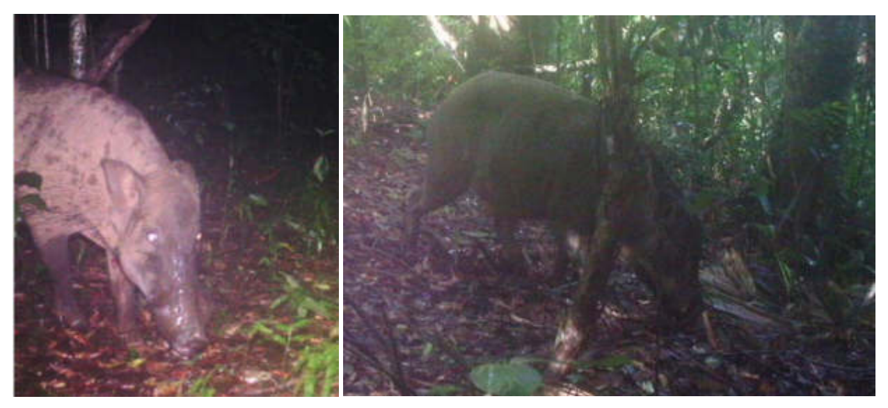
Figure 19. Morphology of 2 different wild pigs (sus scrofa and sus bucculentus)

There were two different species of wild pigs were caught on camera trap, usually known Eurasian Wild Pig ( Sus scrofa ) with its long snout, but one of them was likely Sus bucculentus as its shorter snout (see Fig. 19). It is believed there would be identified to this species. As it was rediscovered in 1997 (Grove et al. 1997) after having gone unrecorded since first being described in 1892. The Annamite is the habitat of this species. On the other hand, it is possible to be a hybrid with domestic pig which is hard to make decision from just a picture. Also, Owston's Civet and Spotted Linsang are other rare species which are difficult to obtain their pictures from the wild (see Annex 7) but they were captured on camera trapping.