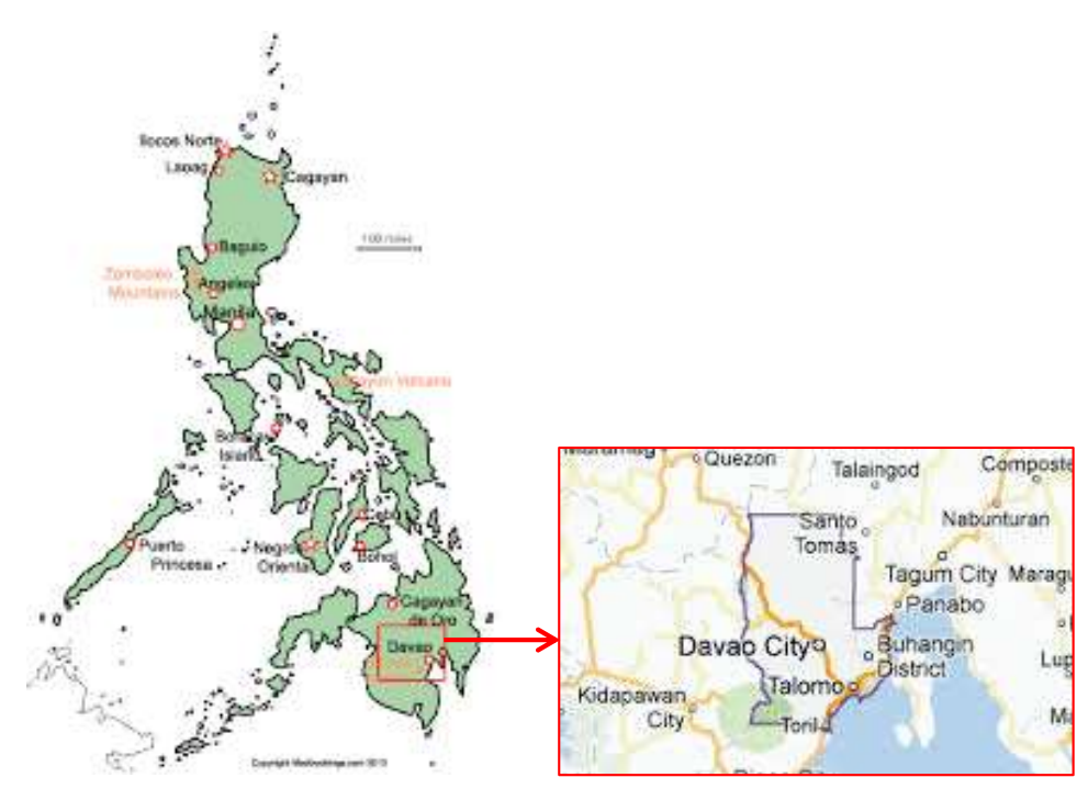
Figure-1 Location of Davao City