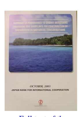
<u>Full text of the</u> <u>Objection Procedures</u>