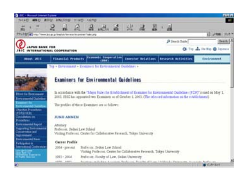
The web page on the Examiners

The Examiners inserted articles of the brief outlines of the Objection Procedures and profiles of the Examiners in "JBIC TODAY," the JBIC's newsletter, in order to introduce the Examiners themselves and their activities.