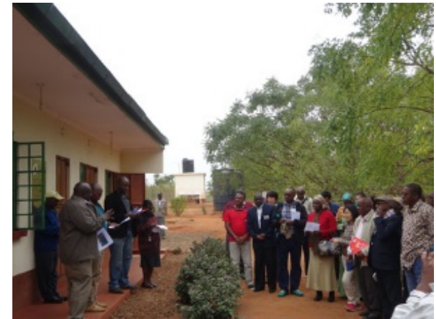
Sustainable forest management to improve forest cover in Kenya