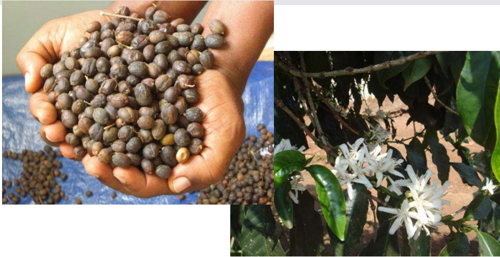
Forest conservation and livelihoods through forest coffee production in Ethiopia