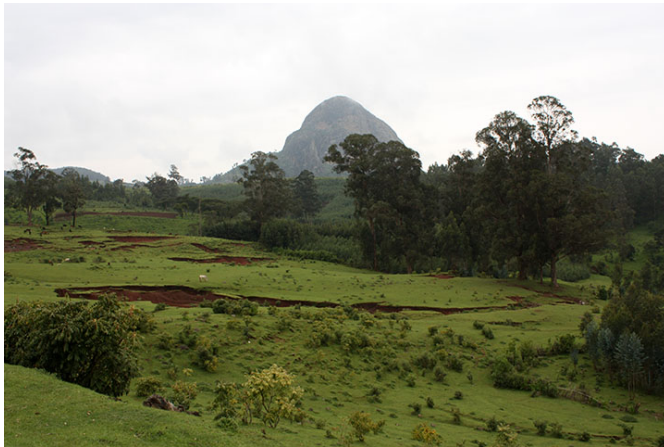
Sustainable land management framework development against desertification in Ethiopia