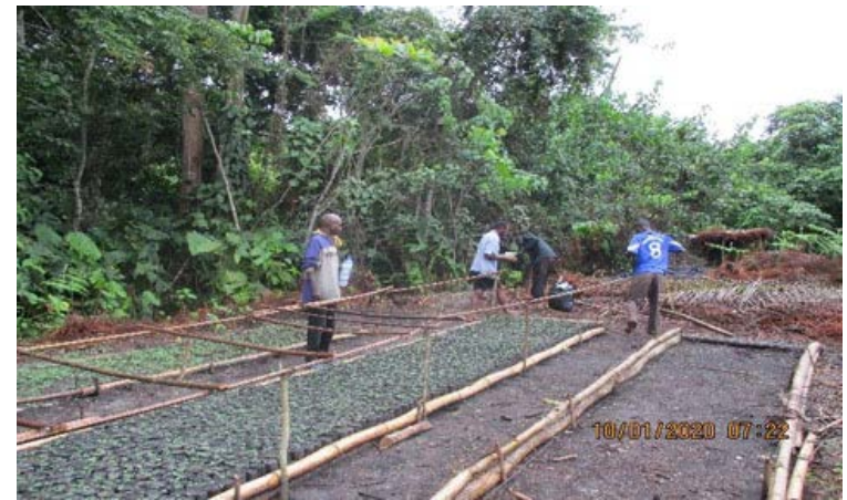
National forest monitoring and province-level REDD+ pilot implementation in DR Congo