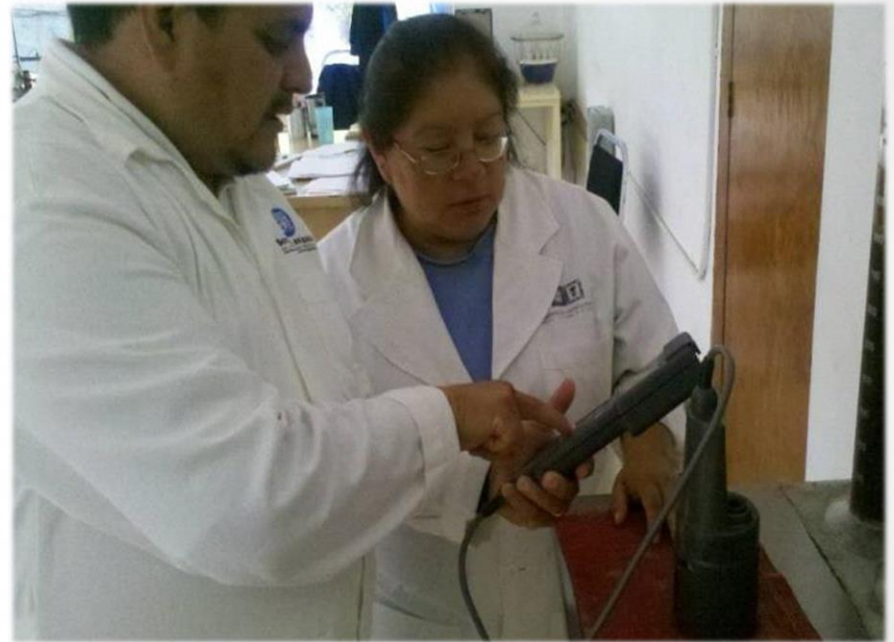
Training on water quality instrument (2013)