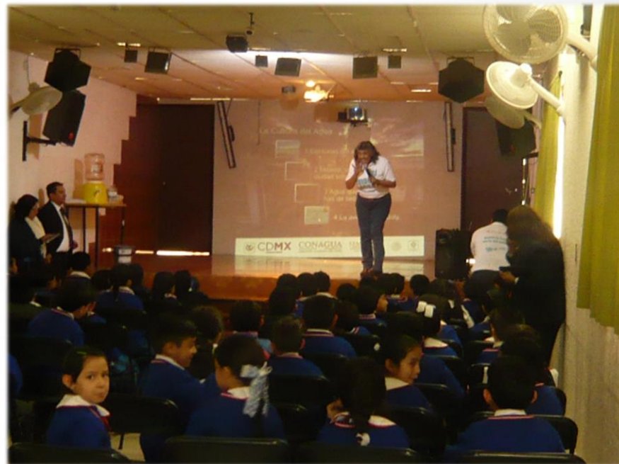
Workshop in Mexico City (2015)