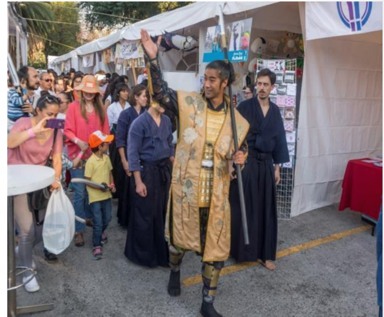
(Mexico) Bushotai (warlord group) participated in autumn festival