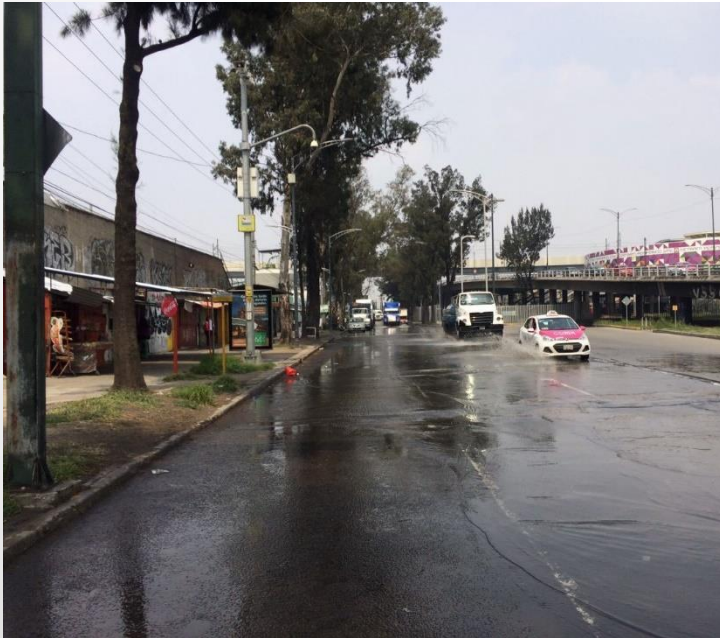
Road flooded with leaked treated water