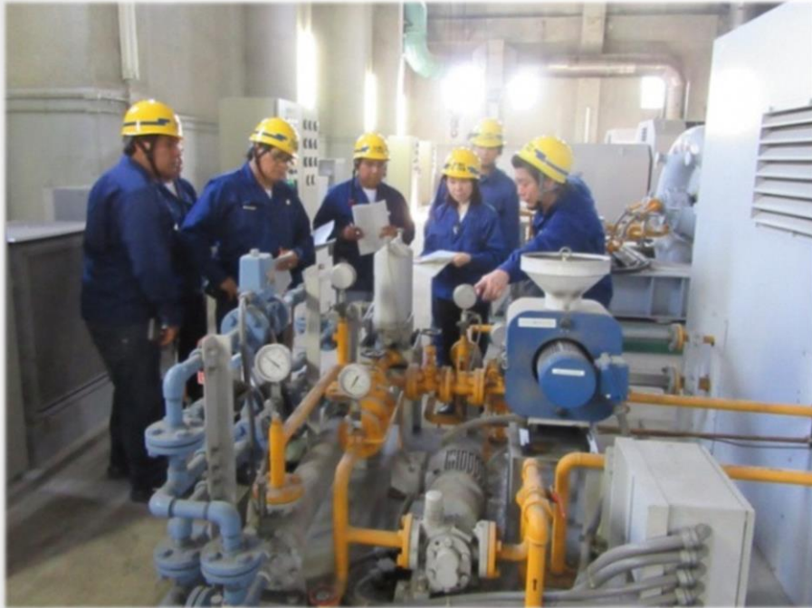
Visit to sewerage treatment plant (2016)