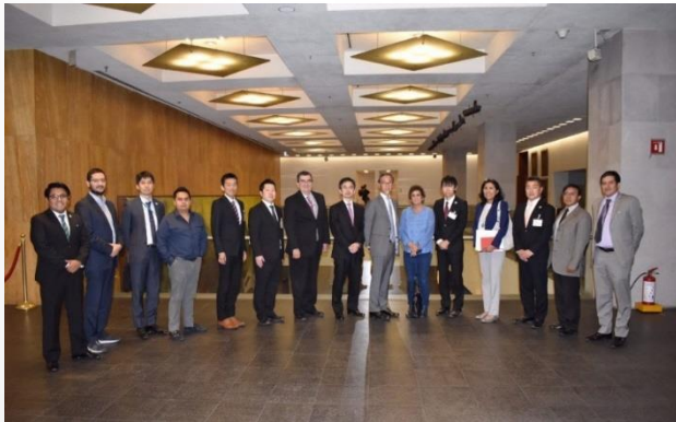
Kickoff meeting participants