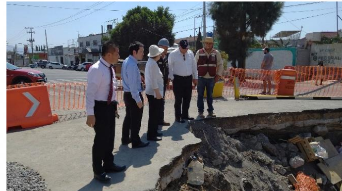
Visit to water supply pipe construction work site