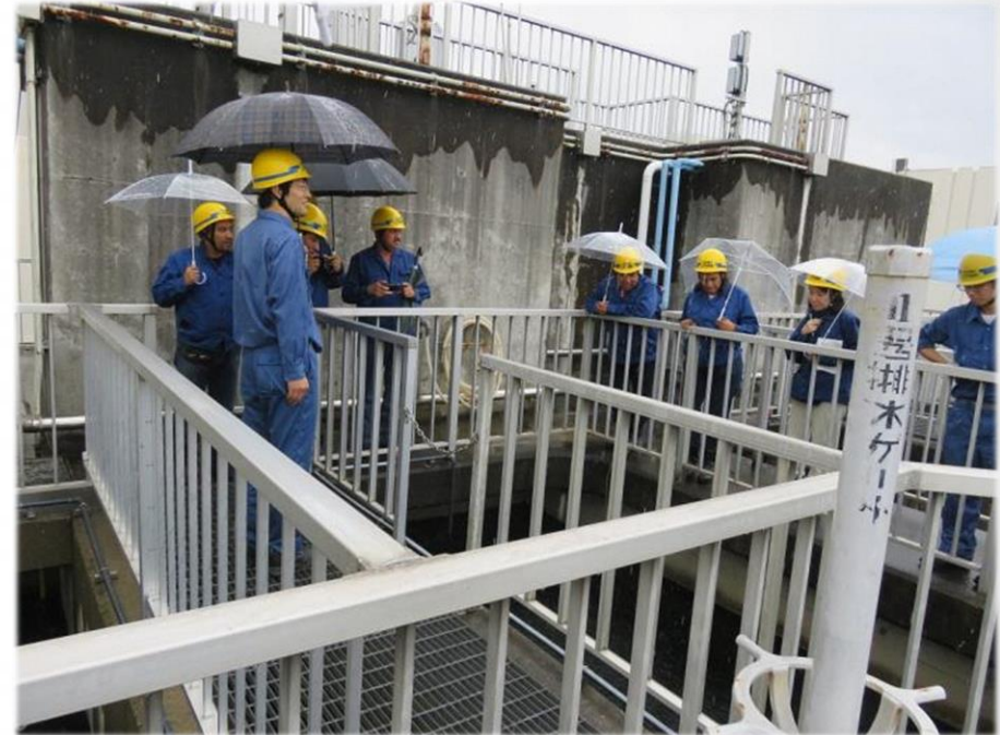
Visit to sewerage treatment plant (2015)