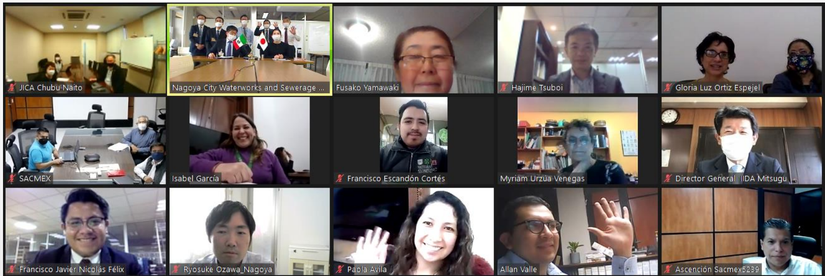
Group photo after interim report meeting