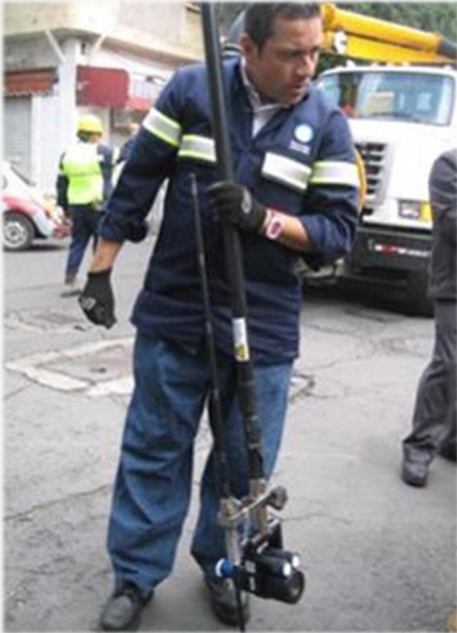
Investigation of TV camera (2012)