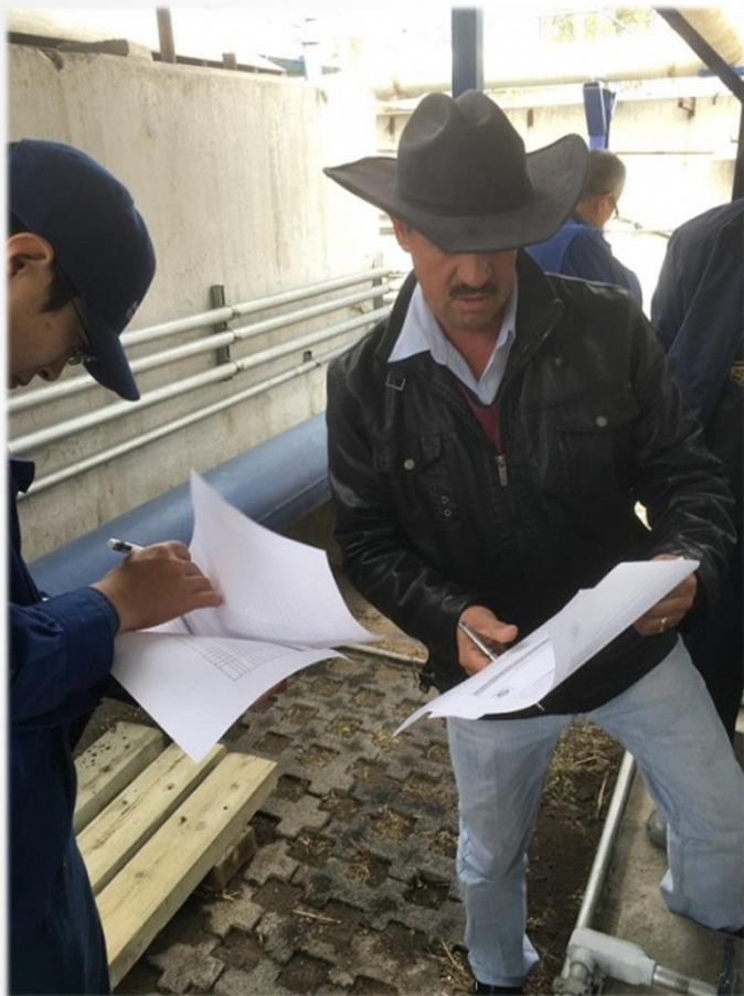
Technical guidance on operation and management (2015)