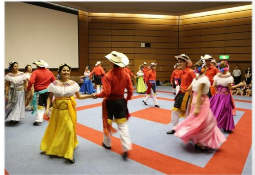
Exchange in Nagoya