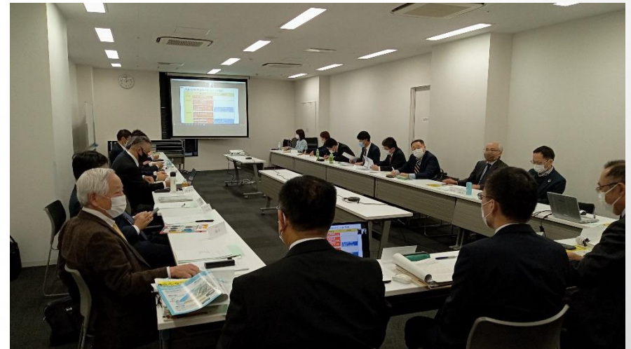
Scenes from the review meeting