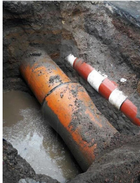
Leakage from water treatment pipe