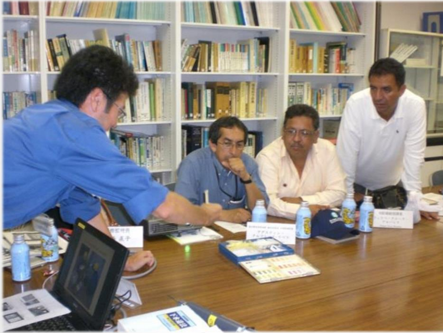
Receiving lecture (2013)