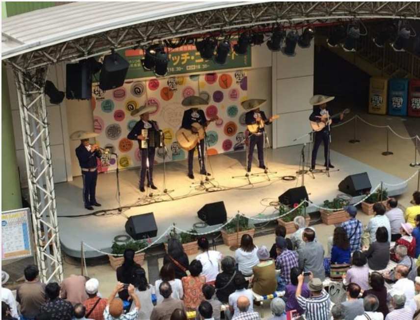
(Nagoya) Holding the mariachi concert