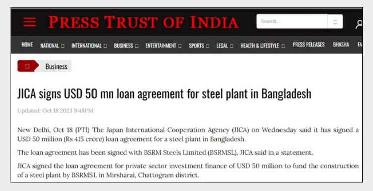
Press Trust of India