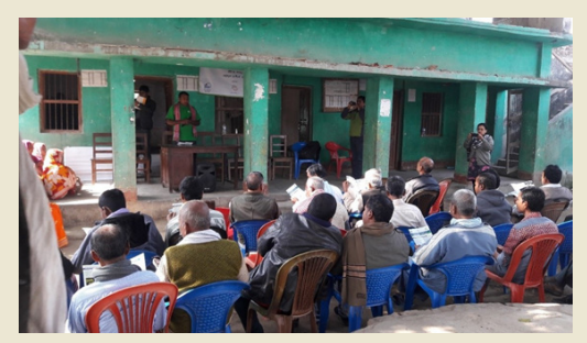
Inauguration of community mediation center in Dhanusha

Community Mediation today is recognized as an effective way for dispute management at the community level and local government operation Act 2017 has given these responsibilities to the local judicial committees.