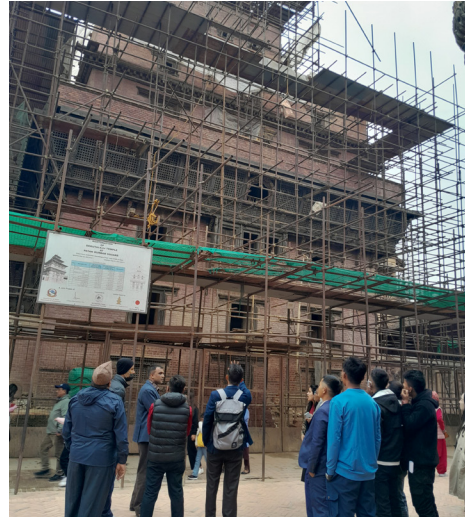
Students observe the ongoing reconstruction works at the Degu Taleju Temple in Patan Durabar Square which is supported by the Government of Japan.