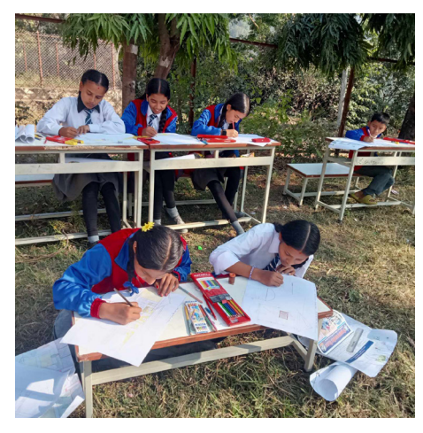
Students at work in Sulakshana Secondary School, Nuwakot

Heartiest Congratulations to all the winners who were entitled to prizes, certificates and many more! Huge gratitude towards CLPIU/MoEST, all concerned EDCUs and participating schools for making this event successful.