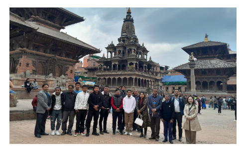
Students in Patan Durbar Square