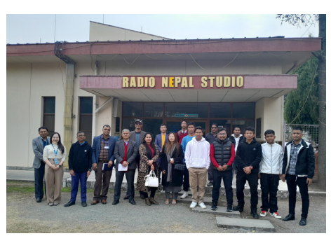
Radio Nepal Studio was constructed through JICA's Grant Aid Project in 1982

Let's continue to celebrate the boundless creativity of our youth as they paint a brighter future!