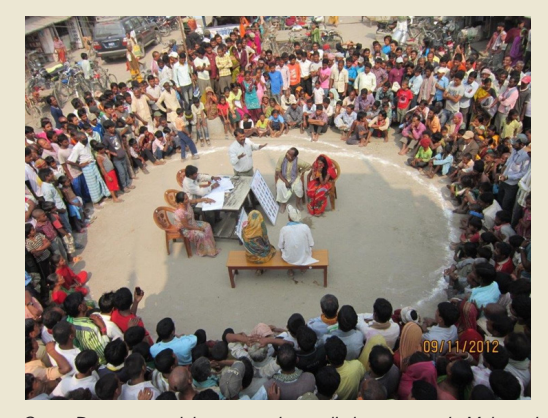
Street Drama to explain community mediation process in Mahottari