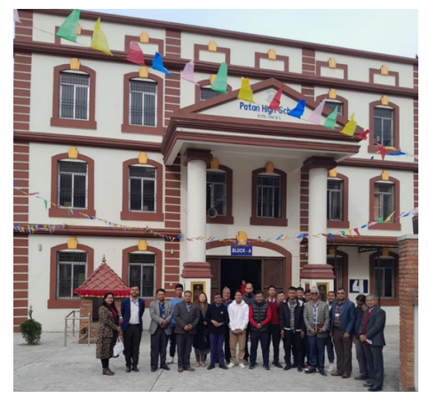
Students posing with the school officials of Patan Secondary School, one of the schools reconstructed through JICA's Emergency School Reconstruction Project (ESRP) in 2021.

regional hubs for improving the quality of education. Total 274 disaster resilient schools with 765 blocks and over 4700 rooms were built by ESRP in Gorkha, Dhading, Nuwakot, Makwanpur, Rasuwa and Lalitpur Districts, based on the earthquake-resistant type design guidelines under principle of "Build Back Better"". The Project was implemented by Central Level Project Implementation Unit (CLPIU)/ Ministry of Education, Science and Technology (MoEST). The construction of all 274 schools was completed in April 2023.