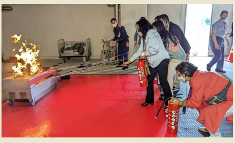
Fire extinguishers practice.