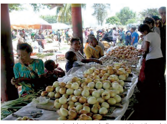
Locals buying and selling vegetables at the market

It is important that markets have accessible designs for anyone because those are necessary facilities for daily lives of community people. In developing countries, however, the actual situations are that often such markets are difficult for persons with disabilities to access, for instance having many steps and no wheelchair-accessible restrooms. By incorporating the accessibility concept from the preparatory study stage, this project realized the accessible market for anyone in the local community, not just persons with disabilities. Measures to do so included installation of ramps between facilities and accessible restrooms for persons with disabilities.