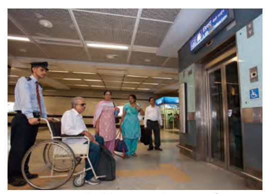
A wheelchair user and station staff waiting at the platform for the subway

In Delhi, where traffic congestion and air pollution have become serious problems as the economy has developed and the population has grown, the project constructed a subway (the Delhi Metro) using Japan's financial assistance and technology. Through repeated discussions with Disabled People's Organizations (DPOs) from the planning stage, accessibility standards were adopted, including the installation of elevators and wheelchair ramps and the elimination of differences in level in railroad cars and on platforms. As a result the completed railroad cars and stations are accessible not only for persons with disabilities, but for most people. Also, the agency operating Delhi Metro became conscious of accessibility for customers, which was one factor leading to increased satisfaction on the part of users. In addition, the efforts on Delhi Metro have had a positive effect on the awareness of personnel of the organization administering roads. This has led to the improvement of the environment surrounding stations in consideration of the safety of users. Examples include the renovation of street lights and parking near stations and the construction of a new bus terminal.