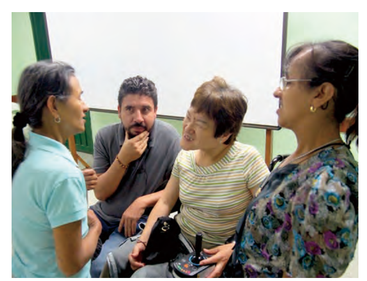
A JICA expert exchanges with local persons in Colombia

was the rehabilitation system, but measures are needed to bring about the social reintegration of the victims. To promote social participation of victims with disabilities, the Project for Social Inclusion of Conflict Victims with Disabilities was commenced in 2015. For this project, two towns were chosen as the pilot sites. In each locality, a study is carried out on the situation of persons with disabilities and their local communities. Based on the results of those studies, activities were implemented to promote the social participation of persons with disabilities, and the results of those activities were organized into a strategy. In the process of carrying out these activities, we think it is important for persons with disabilities to play a central role in planning and implementation, and we strengthened Disabled People's Organizations (DPOs) and to improved accessibility with regard to both the physical and information aspects. One of the experts dispatched from Japan was a wheelchair user and we made use of the viewpoint of persons with disabilities in implementing the activities. The outputs of the project have been compiled into a set of strategy paper on social inclusion of conflict victims with disabilities, which are executed by various government ministries in Colombia.