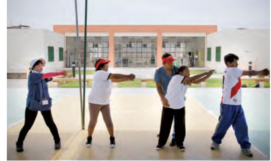
Young persons with disabilities receiving gymnastics instruction

JICA has been implementing training programs that promote the social participation of persons with disabilities through sports for over 30 years. After returning to their home countries, these training participants engage in activities to identify and develop talented athletes and also raise awareness. Over time, this series of initiatives has succeeded in helping to promote sports among persons with disabilities in several countries, such as by inspiring leaders in sports for persons with disabilities, and has even resulted in the development of athletes who compete in the Paralympic Games. With the aim of promoting social participation of persons with disabilities by helping popularize among them in developing countries, the training held in 2019 taught government officials and others about Japanese system for promoting sports among persons with disabilities and passed on competition-related knowledge and skills.