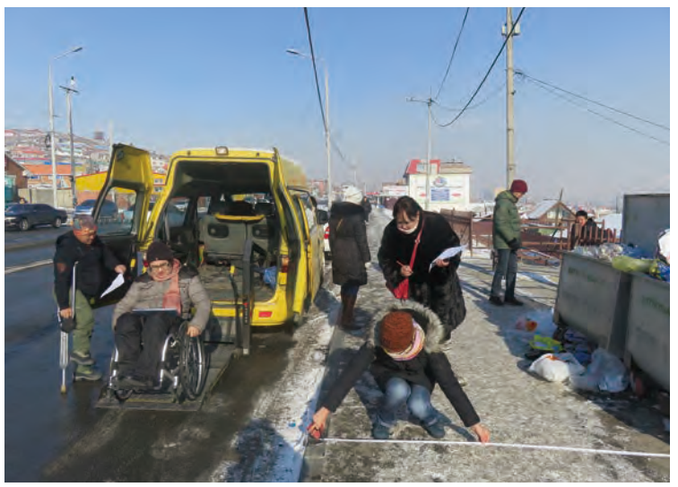
A group of persons with disabilities measures the road width to check its accessibility

disabilities who participated in the training. It should also be noted that, in March 2020, DET regulations were issued by ministerial decree of the Ministry of Labour and Social Protection of Mongolia. Phase 2 of the project began in February 2021, with a focus on employment and developing a system to support the employment of persons with disabilities.