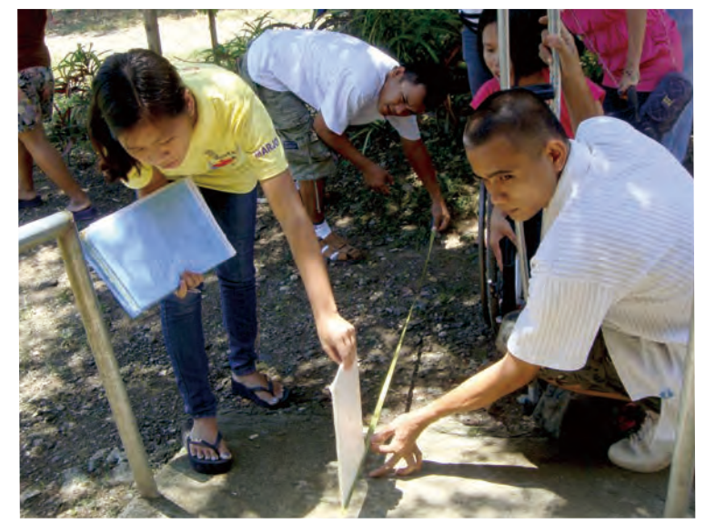
DPOs checking accessibility of a facility

In Iloilo province where flooding damage due to typhoons and torrential rains has become a serious problem, we carried out a JICA Partnership Program to improve disaster risk reduction in the community. At that time, we were conducting a technical cooperation project and volunteer project in Iloilo province to promote the capacity building of Disabled People's Organizations (DPOs) and establish accessible environment by partnering with DPOs and local governments. Through these collaborative activities, the need for disability inclusive disaster risk reduction was recognized by local stakeholders, and as a result, DPOs participated in the planning process for the city's disaster risk reduction plan, voiced opinions on how to manage shelters, and compiled a map of the areas where people with disabilities live. In 2013, when Typhoon Haiyan struck the area, because the DPOs' leaders in the affected area had the contact information of their members, it helped ensure that emergency relief supplies could be distributed to persons with disabilities. By strengthening the capacity of DPOs during normal times, coordinating with local government, and helping improve the understanding of disabilities among local residents, this project was an