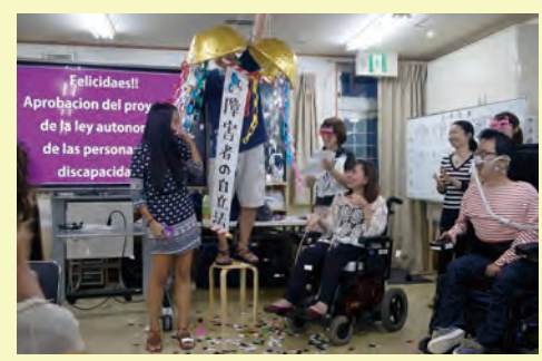
Welcome party in Mainstream Association for training participants

The success achieved in Costa Rica is also having an impact on neighboring countries. In 2020, an online kick-off seminar was held to launch a network to promote the independent living movement in Latin America from Mexico to Argentina, attracting 400 participants from countries in the region. To further promote this initiative, JICA continues to implement training in Japan and Costa Rica to foster leaders of persons with disabilities and promote independent living. Persons with disabilities in Costa Rica, who have been empowered by the independent living movement in Japan, have grown to become leaders in promoting the empowerment and social participation of persons with disabilities around Latin American, and are now serving as inspirational partners of JICA.