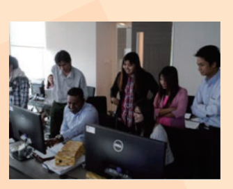
Students participating in a cyber-attack simulation

In 2014-17, JICA cooperated in strengthening the capacities of Indonesia's Ministry of Information and Communication to better combat cyber-security threats. Later, JICA expanded its cooperation by working with the University of Indonesia to improve their cyber-security programs to produce qualified professionals who are ready to defend Indonesian businesses from cyber-attacks. JICA is conducting this project in collaboration with various Japanese government institutions and universities.