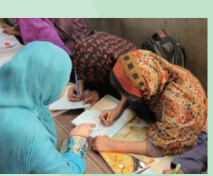
Children learning to solve math problems through their math