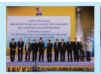
Laos launches its first Civil Code

The rule of law serves as the foundation for individuals' rights to <u>life</u>, <u>livelihood</u>, <u>and human dignity</u>. Across Asia, JICA has worked to strengthen judicial systems and policies, as well as promote community policing and support media development. In Laos, JICA has provided long-term support to help the Government of Laos draft and enact their country's first Civil Code.