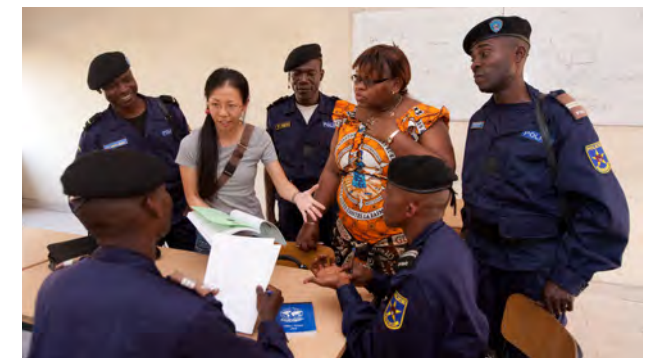
JICA official confirming trainees' leaning level at the venue of National Police Democratization Training (Democratic Republic of the Congo)