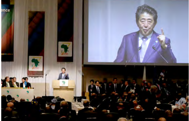
Prime Minister Abe announced that the Japanese government would do its best to further increase private investment toward Africa that had reached approximately USD 20 billion in the past three years. Enterprises also showed their commitment to actively promote their African business.