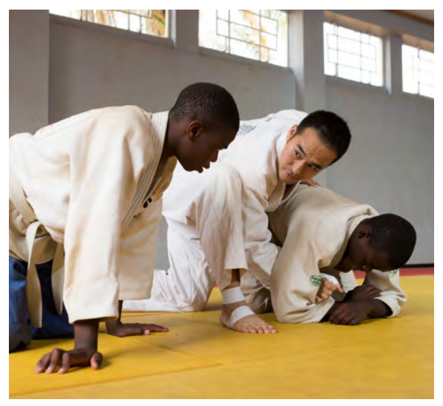
JOCV volunteer instructing Judo at a sport center in the capital city (Malawi)

Provide sports instruction and guidance to disseminate sports for women and people with disability in African countries. Contribute to peace and stability through sports. Conduct matching and follow-ups with Tokyo Olympics/Paralympics host towns