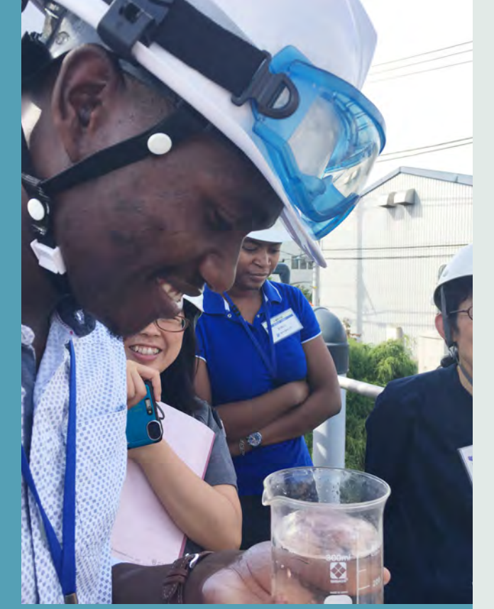
ABE Initiative trainee working as an intern at a firm in Yokohama City