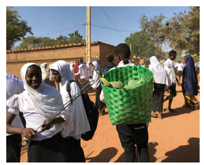
Cleaning campaign was conducted at a middle school in the capital city to create a 'Clean City' (Niger)

Develop infrastructure from both "hardware" and "software" aspects focusing on waste management, water supply/wastewater facilities and urban development targeting at African cities that are rapidly urbanizing, in order to contribute to sustainable urban development