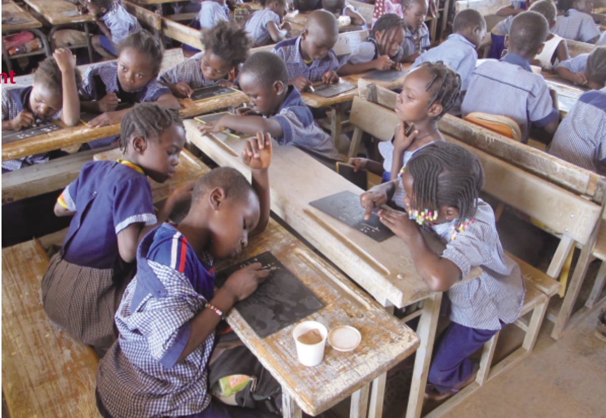
A four-year JICA project to help schoolchildren in the Burkina Faso capital of Quagadougou