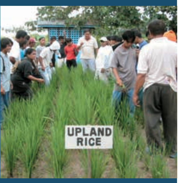
Rice crop training for agricultural technicians

Cooperative activities are somewhat restricted in conflict areas. However,