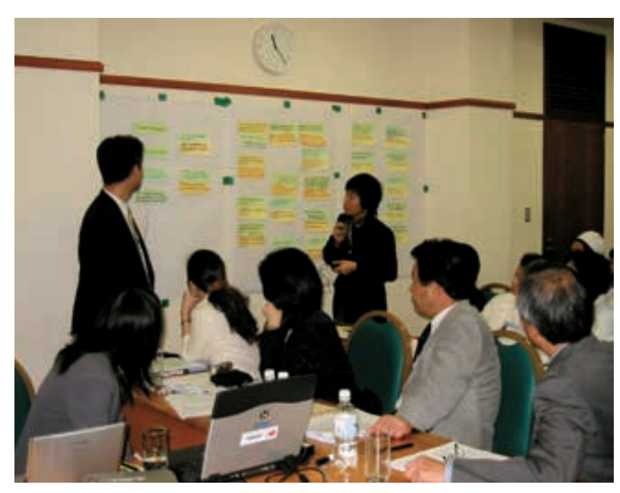
Interim evaluation of The Bach Mai Hospital Project in Viet Nam

Another form of intra-regional cooperation is region-wide projects. In this form, with a base set up in Thailand, cooperation is carried out simultaneously, not only in Thailand but