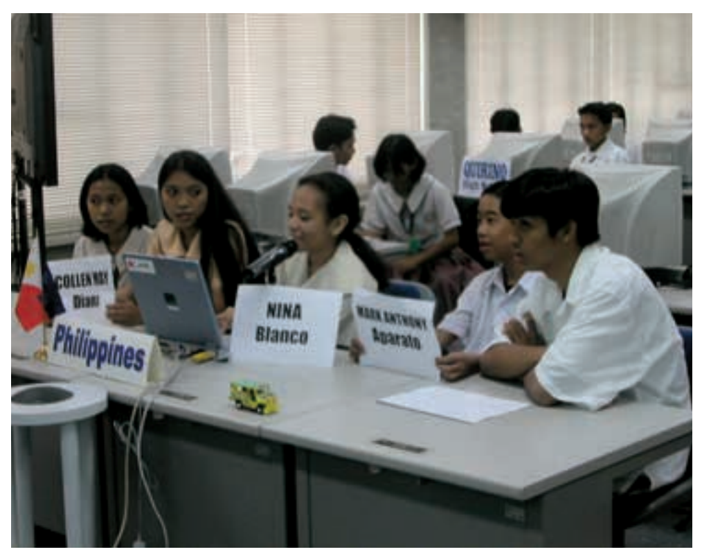
International exchange using JICA-net (long-distance education system) in the Philippines

JICA will make efforts to solve various issues in different countries in a comprehensive manner through a package of technical cooperation projects on prioritized development issues in each country, the so-called Program Approach, while encouraging