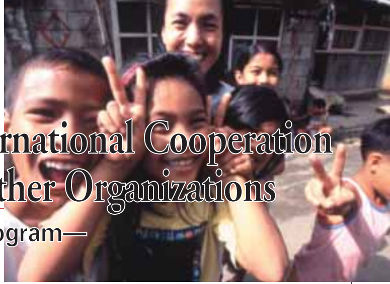
Support for Healthcare and Income in the Payatas District, the Philippines