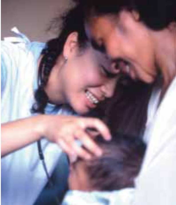
Expansion of the Primary Health Care Program, Timor-Leste