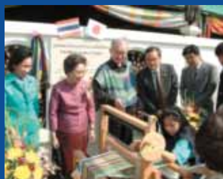
SAORI Creative Center in Chiang Mai

On December 3, 2003, International Day of Disabled Persons, an opportunity was given to SAORI to exhibit a large hand-woven work at the United Nations Economic and Social Commission for Asia and the Pacific (UN-ESCAP) and in