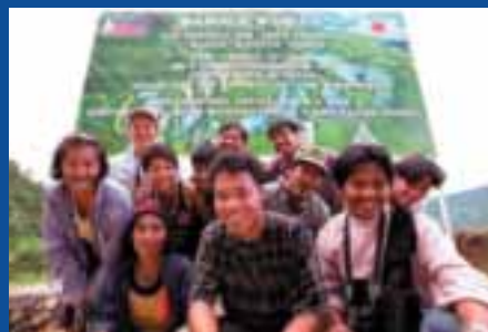
Conservation activity while promoting voluntary participation of local citizens

Since the commencement of the project, one year has passed and both model farms and model forests have been developed. Looking closely at the model sites, local citizens have become more interest-