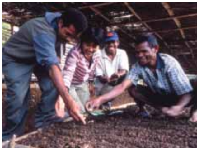
Community Development Project through Fair-trade Practice in Letefoho sub-district of Ermera, Timor-Leste

The role of JICA coordinators for international cooperation, who are dispatched to prefectural international exchange