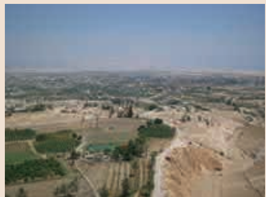
Jericho, located in the southern part of the Jordan Valley: fertile land suitable for agriculture

In addition, Feasibility Study on Agro-Industrial Park Development in Jordan River Rift Valley in Palestine has started. In this study, plans will be formulated, including a construction plan for an industrial park that takes into consideration an external market where processed agricultural products and other industrial products are traded and a plan for the promotion of regional trade and the establishment of a distribution infrastructure. By consistently supporting the promotion of agriculture and the production and distribution of processed agricultural