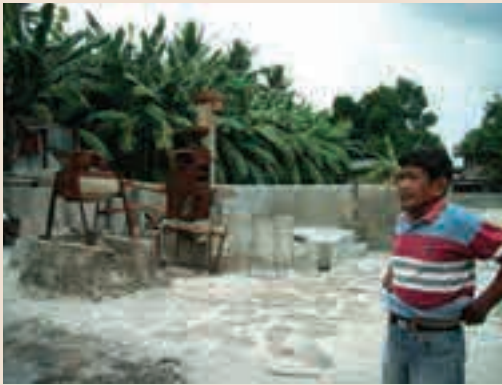
A milling factory that burned down during a conflict (Mindanao, the Philippines)

groups are currently adopting different educational curriculums. JICA is implementing support for IT education with the idea that those curriculums will be integrated in the future, providing opportunities for students in different ethnic groups involved in the conflicts (Croats and Muslims) to learn together and promote mutual understanding.