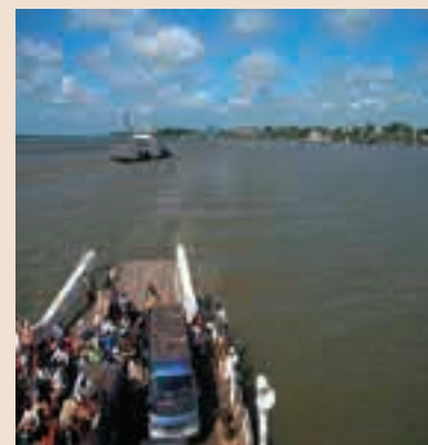
Ferry transportation at the crossing point on the Mekong River (Cambodian side): A maximum of three ferries operate between 5:30 a.m. and 9:30 p.m. every day.

aims to promote harmony with international rules by establishing transparent economic and corporate law systems that incorporate Japan's knowledge and experience. The cooperation, which started in November 2004, had already achieved an outcome by October 2005, when corporate laws were revised at the Standing Committee of the National People's Congress.