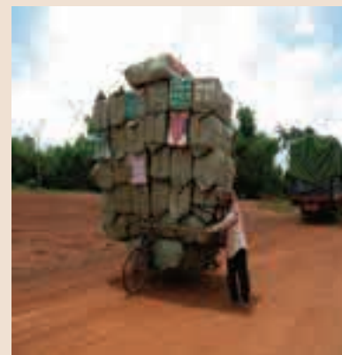
Near the border of Cambodia with Viet Nam, where humans and goods travel: Daily necessities stacked on a bicycle enter Cambodia, while timber leaves for Viet Nam.

As the transition to a market economy progresses, establishment of corporate laws and the anti-monopoly laws became an urgent task in China. With regard to these laws, JICA comprehensively has introduced Japan's systems, from legislation to enactment of laws, to promote understanding of relations between corporate laws, anti-monopoly laws, and other related laws. By examining and advising on specific issues, JICA also has facilitated an improvement in China's understanding of legal interpretation, such as the actual significance and function of these laws. This cooperation