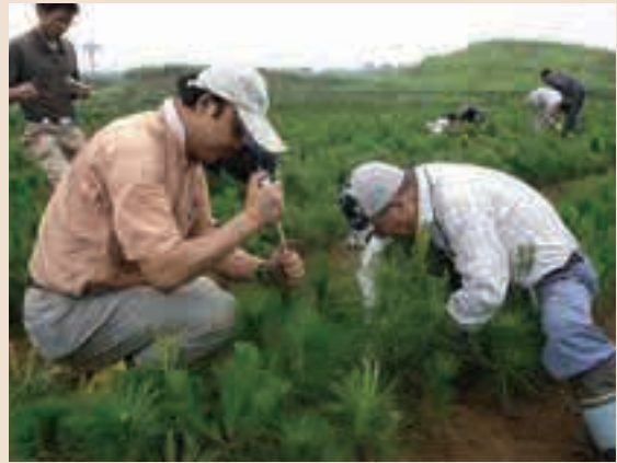
Pest resistance test to select seeds resistant to environmental changes caused by global warming

*2 United Nations Framework Convention on Climate Change (UNFCCC): With the ultimate objective of stabilizing the concentration of greenhouse gas in the air, this agreement provides an international framework to prevent negative influences caused by global warming. It was adopted at the UN