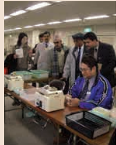
Staff members of the election board learn about vote counting in training in Japan.

*2 According to the Armed Conflict Report published by Project Ploughshares in Canada, 45% of the countries ranked in the lowest half and 51% of the countries ranked in the lowest one third in the human development index (HDI) experienced conflicts between