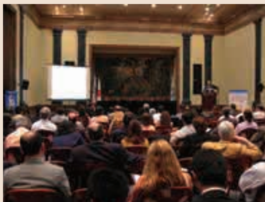
An international seminar attended by approximately 190 CDM related persons from 12 countries, mainly in Central and South America (Argentina)

Global warming is an issue common to all mankind. At the same time, it is a sector where Japan can effectively utilize its comprehensive capability (knowledge, institution, skills, and awareness) accumulated in the public and private sectors based on experience in the sectors of environmental pol-