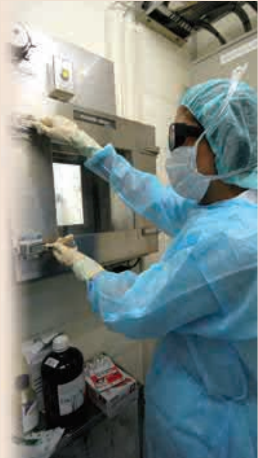
Fighting the threat of avian influenza with international cooperation (see p.13)

Although JICA generally implements bilateral cooperation, support for cross-border issues is also promoted in cooperation with international organizations and other donor countries. This section reports new JICA efforts for issues that expand beyond national borders.