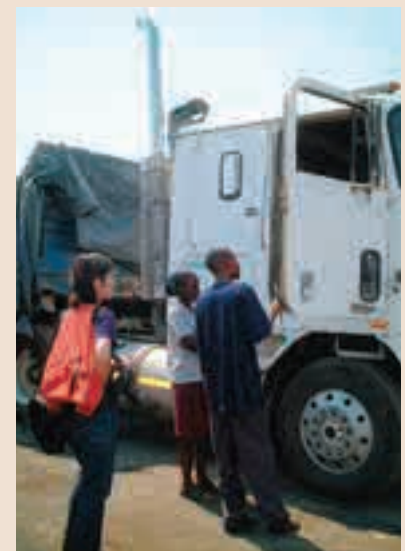
A peer educator (person who has received special education to consider problems with his/her peers) talks to a truck driver about AIDS.

In Zambia, which shares borders with eight countries, JICA has implemented technical cooperation such as the Cross Border Initiative Project since 2000 together with the United States Agency for International Development (USAID). This project targets people working in the sex industry, whose risk of HIV infection is high, and long-distance truck drivers who often cross borders. Through consistent activities that help sex workers share their knowledge with their peers and encourage one another to change their actions, awareness regarding AIDS and sexually transmitted infections has been raised