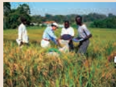
Guidance on cultivation of NERICA rice by a JICA expert (Uganda)

to extend these achievements to neighboring countries.