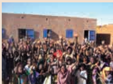
Support for participatory primary school management is provided for the purpose of eliminating lack of understanding about schools among local communities and parents and increasing enrollment. (Niger)

Human resources development is central to a country's development, and enhancing education is therefore essential. Universal education is spelled out as one of the MDGs, but primary enrollment is still low in many of African countries. JICA will implement and strengthen various types of educational support, including support that combines the construction of primary and secondary school buildings with know-how of school management.