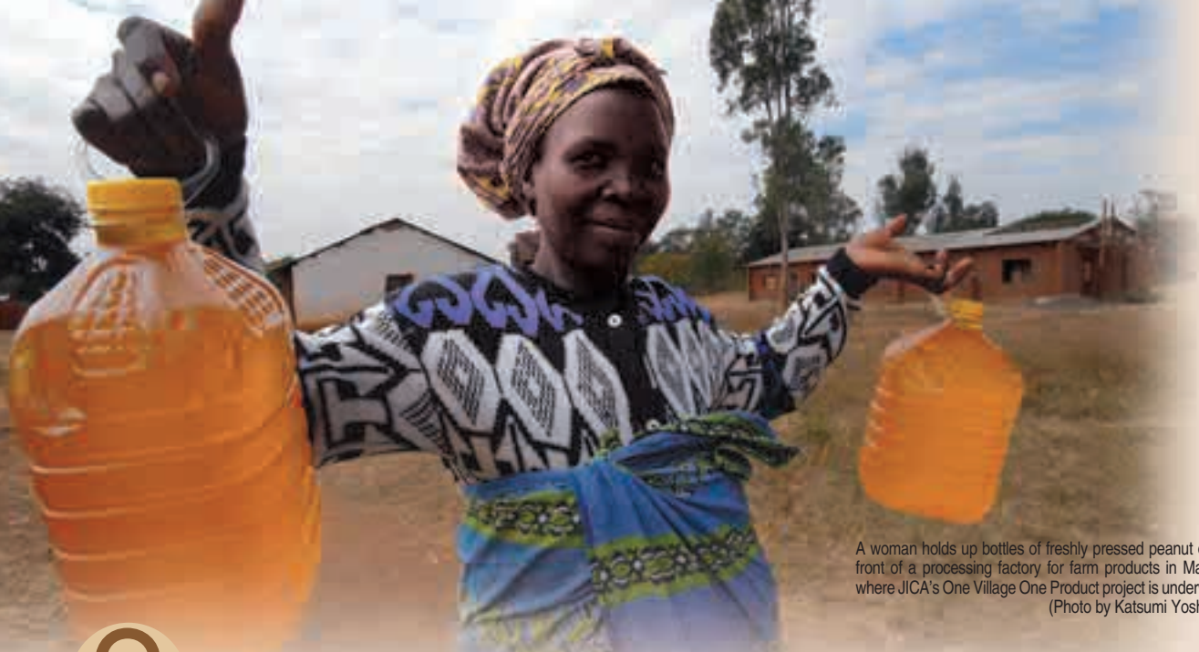
A woman holds up bottles of freshly pressed peanut oil in front of a processing factory for farm products in Malawi where JICA's One Village One Product project is underway.