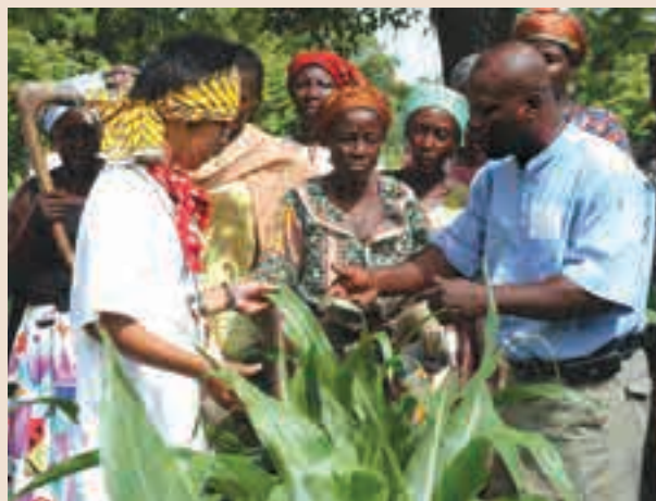
A JOCV member working at an NGO that supports women in the Program for Improving Health Status in Upper West Region (Ghana): This program, which is carried out as a combination of dispatch of experts, grant aid, technical cooperation, and dispatch of JOCV, is an example of undertaking multiple projects in order to effectively address mid-term development issues.

In March 2005, the second phase of the JICA Reform Plan was announced, which introduced the reform of domestic operations (training programs in Japan for personnel of developing countries and citizen participatory cooperation, etc.) and reorganization of domestic offices, in order to meet the needs of