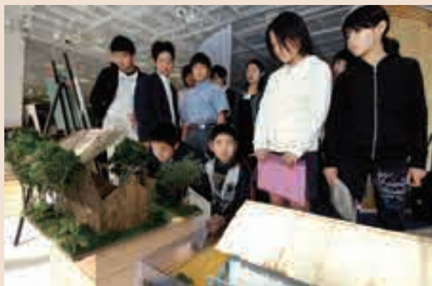
Exhibition entitled "I Want to Go to School" held at the Exhibition Space, JICA Global Plaza

Meanwhile, additional challenges have come to surface. For example, the issue of how the headquarters provides appropriate support for overseas offices, which have a limitation in expertise, as well as how to improve strategy and the predictability of projects managed by overseas offices. In order to respond to these issues, JICA has been committed to addressing the following as final adjustment toward reforms; specifically, establishment of partnerships between the headquarters and overseas offices, enforcement of the strategic nature of projects through the promotion of program based approach, and improve-