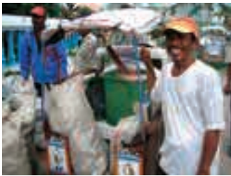
This waste collection activity began as a pilot project for waste management. (The Study on Implementation of Integrated Spatial Plan in Mamminasata in Indonesia)

livelihood of the poverty group through agricultural and community development are examples.