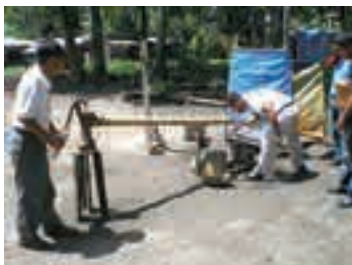
A water quality survey is conducted at the construction site of a water supply facility accompanying the counterpart. (The Study for Socio-Economic Reconstruction and Development of Conflict-affected Areas in Mindanao, the Philippines)

out ASEAN or areas across borders, such as (1) infectious disease control (newly emerged influenza and HIV/AIDS); (2) international crime control (drug control and human trafficking); (3) cross-border regional development (Mekong region development); (4) environmental conservation (acid rain control), and (5) disaster prevention (recovery and reconstruction of areas affected by earthquakes and tsunami and other natural disaster control).