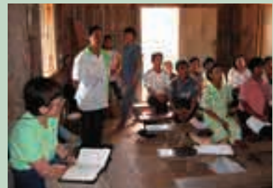
Training is conducted for the Women's Health Team at a remote mountainous area in the province of Ifugao.