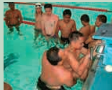
Malaysian national team members receiving guidance from a former Paralympics swimmer

In addition, in order to develop human resources for sign language interpreters, which are scarce in Malaysia, a deaf trainer of sign language interpreters was dispatched to the Malaysian Deaf Association as a