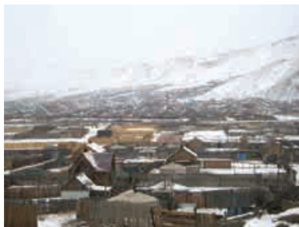
Ger District in the suburb of Ulaanbaatar: The living infrastructure is undeveloped. (The Study on City Master Plan and Urban Development Program of Ulaanbaatar City in Mongolia)

Furthermore, since the development of infrastructure forms the basis of Mongolia's economic growth, JICA also cooperates in urban planning to solve urban problems, including improvement of basic infrastructure in the suburb of Ulaanbaatar (Ger District), which is experiencing a rapid population concentration.