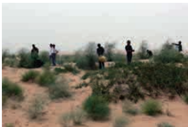
Nomads collecting seeds from planted trees (Seeds Collection for Prevention of Desertification Project in China)