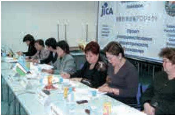
Discussing nursing education at a local seminar (Nursing Education Improvement Project in Uzbekistan)

accession, support for establishing legal systems, institution-building, and human resources development in relation to reforms of financial systems. Specifically, in Uzbekistan, Kyrgyzstan, and Kazakhstan, JICA has opened the Japan Center for Human Development to provide aid that is open to the public with a clear profile, such as business courses aimed at developing practical human resources that will push forward the transition to a market economy, as well as activities for promoting mutual understanding and Japanese language courses. In Uzbekistan, projects for establishing legal systems such as the Project for Legal Assistance for Improvement of the Conditions for Development of Private