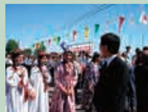
Japanese Ambassador to Tajikistan chats with local people who attended the ground-breaking ceremony