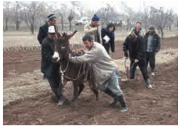
Study team member observing harrow farming for millet seeding (Project Formulation Study for Rural Development in Tajikistan)

In most countries that were part of the Soviet Union, leaders from the Soviet era continued to hold the reins of governments even after independence. The situation is the same in Central Asia and the Caucasus, but the Rose Revolution broke out in Georgia in November 2003 and the Tulip Revolution in March 2005 in Kyrgyzstan (though slightly different in nature), thus resulting in