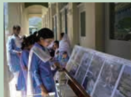
Students looking at photos of the construction process, after the handover ceremony of the Sathi Bagh Government Girls High School