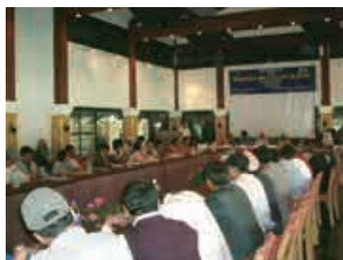
A seminar related to democracy and election systems in Pokhara, a city in western Nepal

As far as conflicts in Sri Lanka are concerned, an indefinite cease-fire agreement was reached between Sri Lanka's government and the ethnic Tamil rebels called the Liberation Tigers of Tamil Eelam (LTTE) in February 2002. Five years after the conflict was suspended, the peace talks between the government and the LTTE are in a static state. Since the conflict was suspended, JICA has continued to support war-affected people and refugees. JICA makes the utmost efforts in the projects that empower communities in the areas affected by the conflict. Together with direct