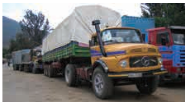
Lines of trucks waiting to cross the border in Namanga, a border town (border between Kenya and Tanzania)

One good example of cross-border infrastructure assistance is a road improvement project between Kenya and Tanzania that was implemented by JBIC through joint financing with the African Development Bank. In this project, a one-stop border post is constructed to unify various procedures for crossing the border, which used to take a long time. JICA is implementing technical cooperation for capacity development of the staff of the customs bureau stationed at this post, providing comprehensive support for roadway infrastructure construction in terms of both hardware and software.