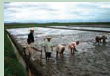
Instruction in paddy field by an expert in rice cultivation technique