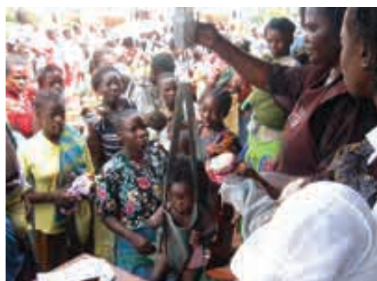
Periodical examination of infants (Lusaka District Primary Health Care Project Phase 2 in Zambia)

JICA will further expand regional water supply projects including deep well construction, which have been provided actively so far, and will preferentially implement cooperation projects with consideration given to the poor, women, and the socially vulnerable. Furthermore, in order to raise the maintenance and