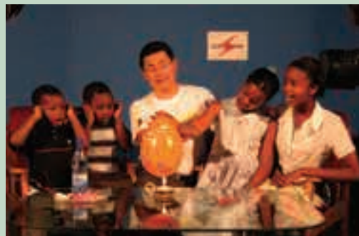
Scienceman is loved by people of all ages.