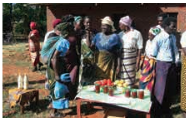
Demonstration of agricultural products and processed goods by residents (Institutional and Human Resource Development Project for One Village One Product Programme in Malawi)

In 2005, the NEPAD Domestic Support Committee was set