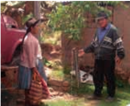
With water pipes connected to every household, safe water supply improved hygienic conditions and reduced women's and children's labor for drawing water. (The project "Water is Health and Vital" in Bolivia)

In Bolivia, mainly in villages where wells were built using the equipment provided through grant aid, the upgrading of the water supply system is promoted in cooperation with the Inter-American Development Bank and other donors. Also, in cooperation with activities of Japan Overseas Cooperation Volunteers, a project called "Water is Health and Vital" is being implemented to promote rural development activity aimed at increasing cash income. The purposes of the project are to transfer the maintenance and management skills of the water supply system, disseminate clean water, and sustain the effects.