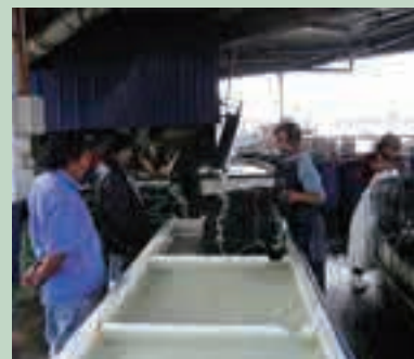
Training in the aquaculture field: Chilean women's participation in aquaculture led to Peruvian women's active participation in the project.