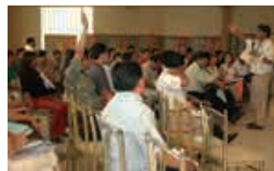
Introducing successful cases and PCM methods to improve project design and formulation capabilities of municipal staff (Local Activation through the Experiences Shared among the Municipalities in Peru)

To support the socially vulnerable, such as internally displaced persons and street children, efforts aimed at reconstructing basic living infrastructure are required. In Columbia, volunteers are dispatched to facilities where internally displaced persons and the socially vulnerable are housed. They give instructions on recreational activities and small plays that foster imagination as well as on the production of crafts using available materials so that the children in those facilities can have opportunities for the future.