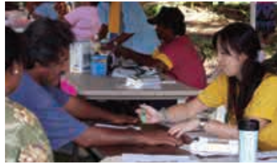
JOCV's educational activity for local residents in a campaign to prevent diabetes (Micronesia)

Each country is taking steps to reduce its public sector, encourage private investment to promote primary industries, namely agriculture, fishery, and tourism, and promote regionwide cooperation to collectively deal with issues common to the region. The Pacific Islands Forum (PIF), a framework for regional cooperation among the island countries, adopted a regional development plan called the Pacific Plan in October 2005, which actively addressed identified priority issues common to the region. Self-help efforts of the respective countries in the region and support from many aid agencies are expected for the concrete implementation of this plan.