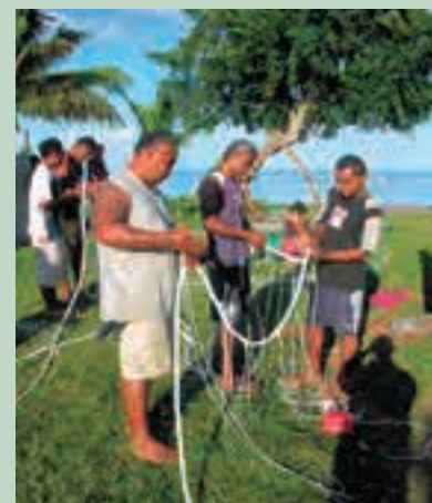
Local people making fish beds