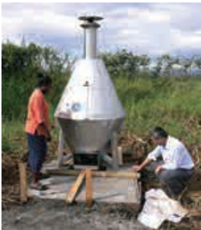
Incinerators for medical waste need to be installed at a distance in order to prevent infection through medical waste (the Project for Strengthening EPI in the Pacific Region in Solomon Islands)

Every country in Oceania differs in respect of its national and economic size, ethnic composition, population, availability of natural resources, traditional social foundations, way of life, and the capacity of government to formulate and administer development plans. Therefore, finely tailored aid in line with development levels and specific development needs of each country is therefore