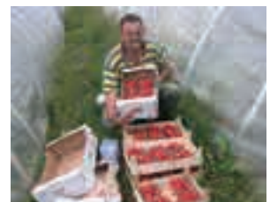
Growing strawberries in a community development project (see p.67) (Bosnia and Herzegovina)

However, this area is not free from unstable social factors such as the Kosovo problems and complicated ethnic compositions within a country. Although the economies recovered to pre-conflict levels, the high unemployment rate is an issue common to the area and it is a concern that it may cause instability to surface.