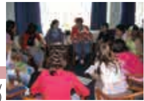
Workshop on peace held at an elementary school in Sarajevo (Bosnia and Herzegovina)