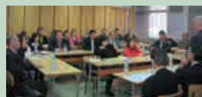
Bulgarian business people and project counterparts from various countries attending the short-term intensive course