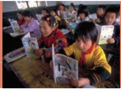
MDGs set out the provision of education opportunities for all children regardless of gender (China)

Challenges shared by the international community toward achieving human development and the eradication of poverty