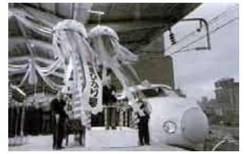
The Tokaido Shinkansen commences service in 1964

Although Japan now has the world's second largest economy, in the wake of World War II it needed loans from the World Bank to finance major infrastructure projects, such as the first bullet train line (Tokaido Shinkansen) and the Tomei Expressway linking Tokyo with Nagoya. Japan finally completed the repayment of those loans in July 1990. Since Japan's experience of rebuilding its economy with the help of overseas partners is relatively recent, it is able to apply this knowledge to effectively support the efforts of developing countries that are building their own social and economic infrastructure.