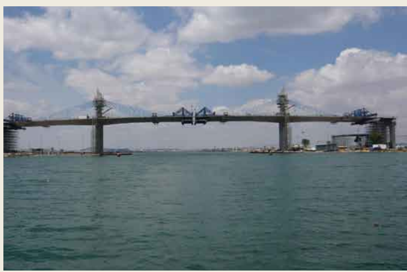
The Rades-La Goulette Bridge

Taking into consideration the future increase in economic activity and tourism demand growth in the area, as well as a foreseeable increase in traffic volume through the business center of the Grand Tunis area as a result of development projects around the Lake of Tunis, solutions for both the traffic and environmental issues are very much desired in the city. JICA began its research because of these conditions, and provided ODA loans to fund the Rades-La Goulette Bridge Construction Project, which was designed based on a research master plan with the goal of alleviating traffic congestion and improving the surrounding environment. This construction project