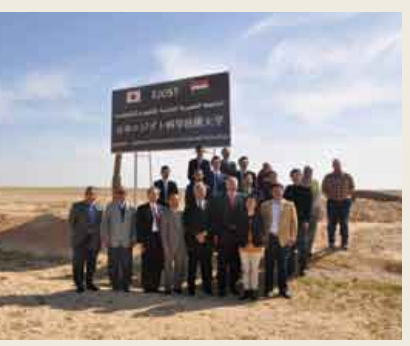
Planned construction site of the new campus

To establish E-JUST, 12 universities in Japan have come together to form the Japanese Supporting University Consortium (JSUC), together with the Japanese business community and