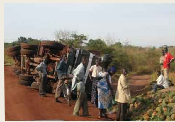
A truck overturned by extremely poor road conditions

return to and settle down in their home villages with a sense of security, JICA is providing reconstruction assistance aimed at reinvigorating their communities and restoring the administrative functions of local government. Furthermore, JICA will support the development of equitable communities, in which an increasing number of North Ugandans will be able to enjoy the dividends of peace after the civil wars.