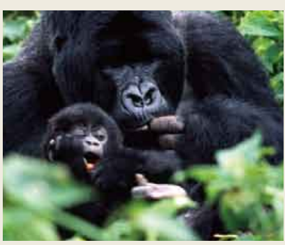
Mountain gorillas are in danger of becoming extinct.

project—conducted in Gabon, a country located in the Congo River basin—aims to conserve biodiversity in the basin's tropical rain forests through trials conducted on the coexistence of people with wildlife. Through this unique project, participants also aim to scientifically understand mountain gorillas and rain forests, while ecotourism is promoted in cooperation with residents of the basin.